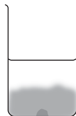
after two days