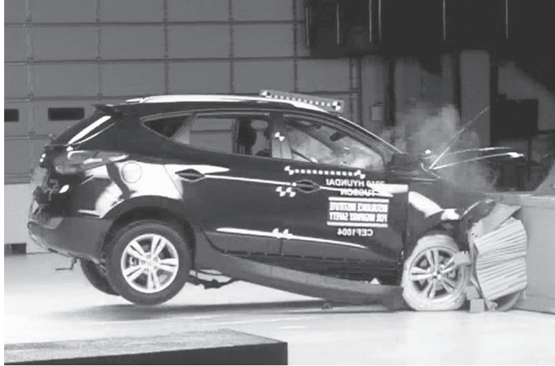
(Author: Brady Holt, 2010)

(c) In a crash test, a car runs into a wall and stops.