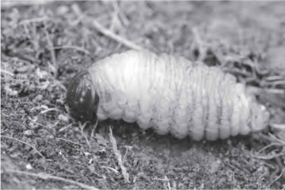
Magnification \times 10

The photograph below shows a larva of R. ferrugineus .