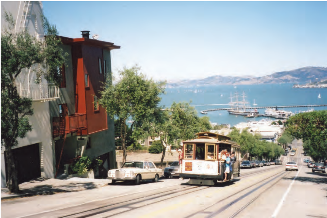
Photograph C for Question 3 is on page 4