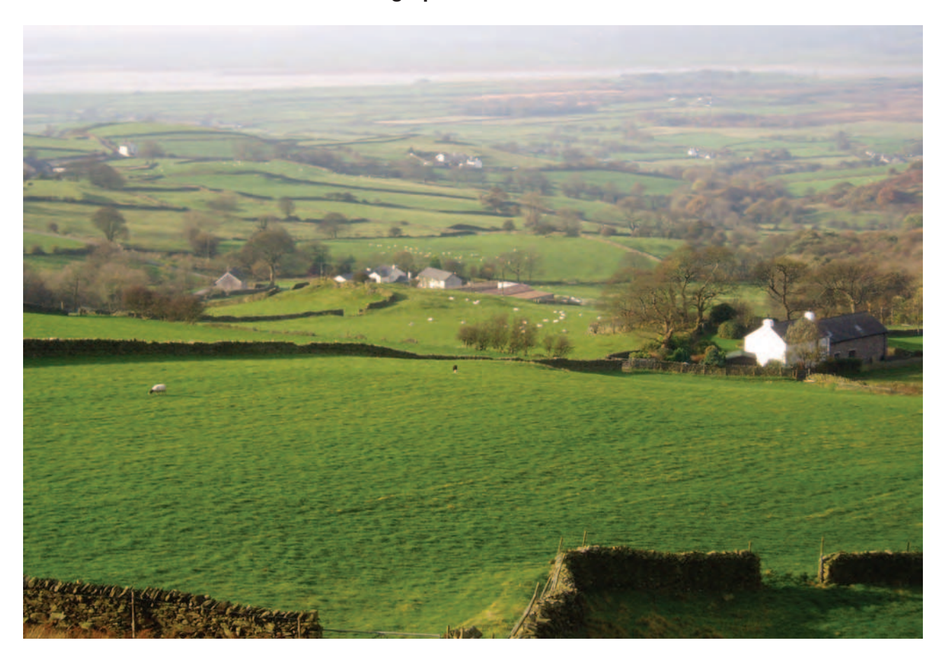
Photograph B for Question 4