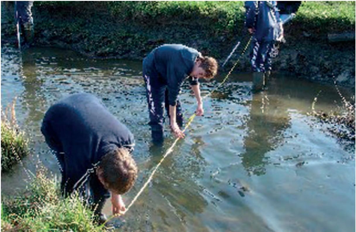
Photograph B for Question 1