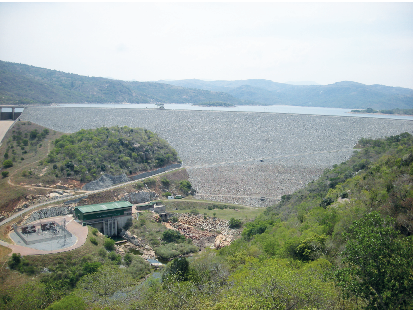
Photograph A for Question 5