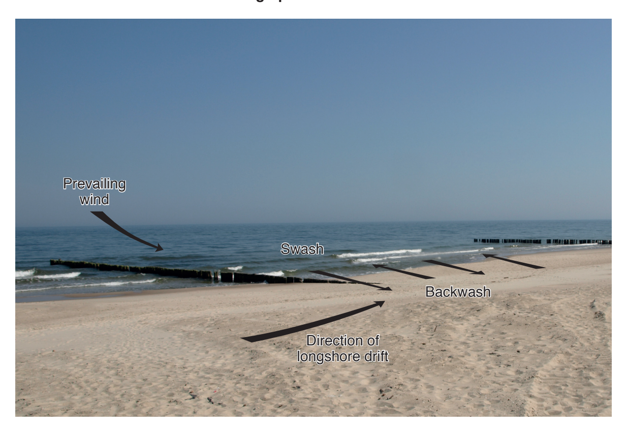
Photograph B for Question 3