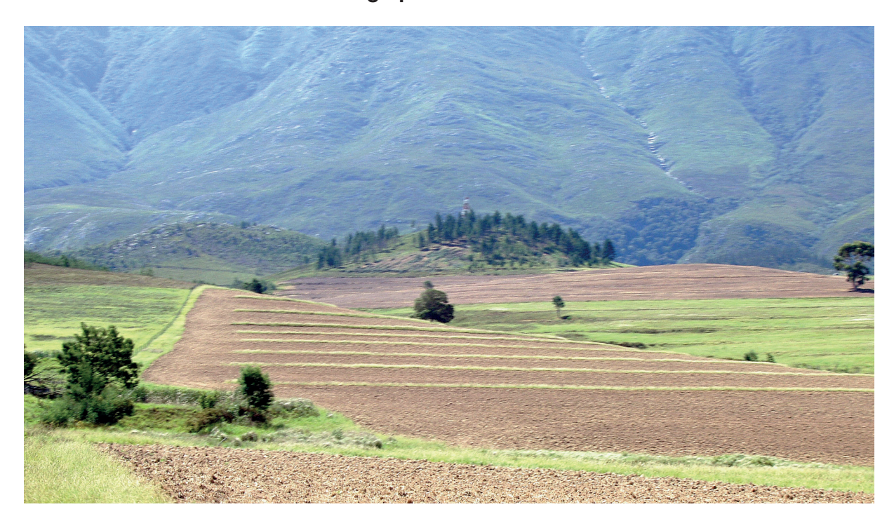
Photograph D for Question 6