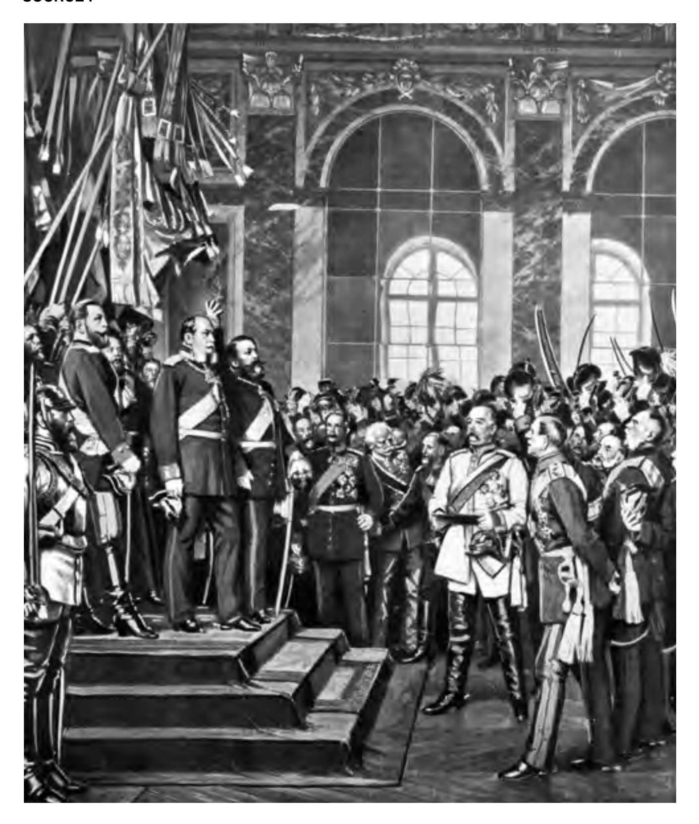
A painting entitled 'The Proclamation of the German Empire'. This is the third version of this painting and was painted in 1885 to celebrate Bismarck's seventieth birthday. The original version was painted in 1871 and showed the occasion as dull, with Bismarck in a less important position. In this version, the artist has placed Bismarck at the centre (in white).