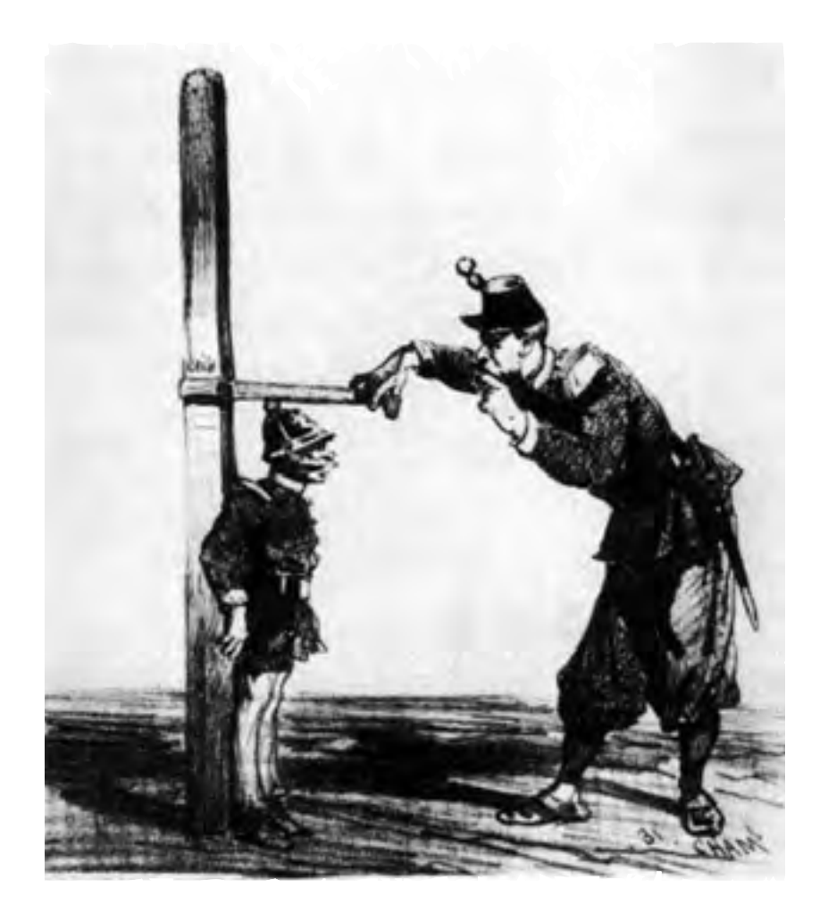
A British cartoon published in 1867. France is saying to Prussia: 'Now you are big enough. You must not get any bigger. I'm telling you this for your health.'