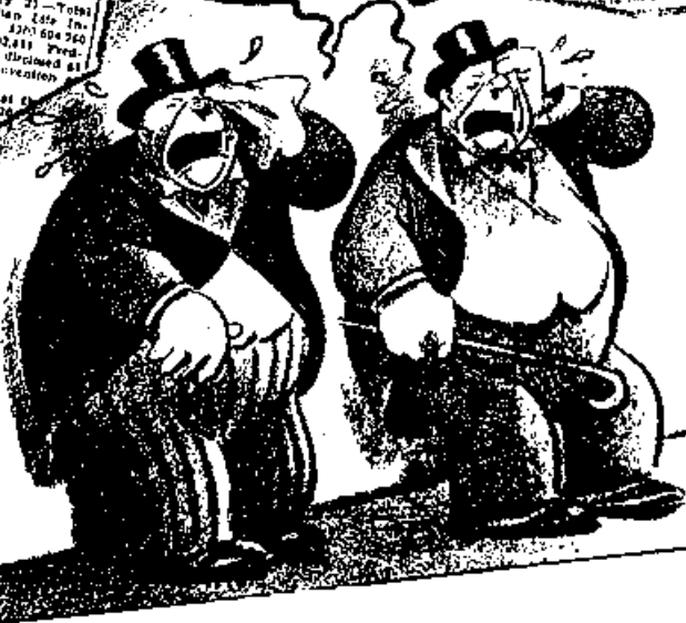
A cartoon published in a US newspaper in 1936.

Preliminary Report for 1935 Shows Equivalent of $4.59 a Share on Preferred. TOP PROFIT SINCE 1930