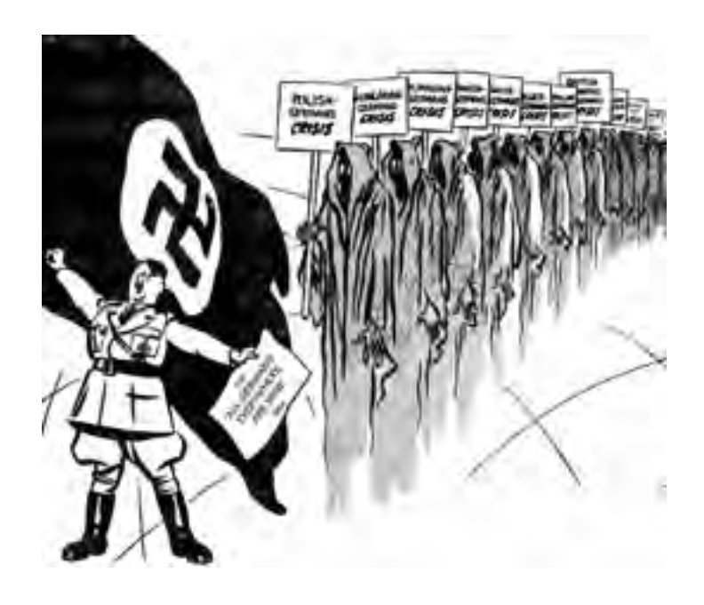
A cartoon titled 'Nightmare Waiting List'. It was published in a British newspaper on 9 September 1938.