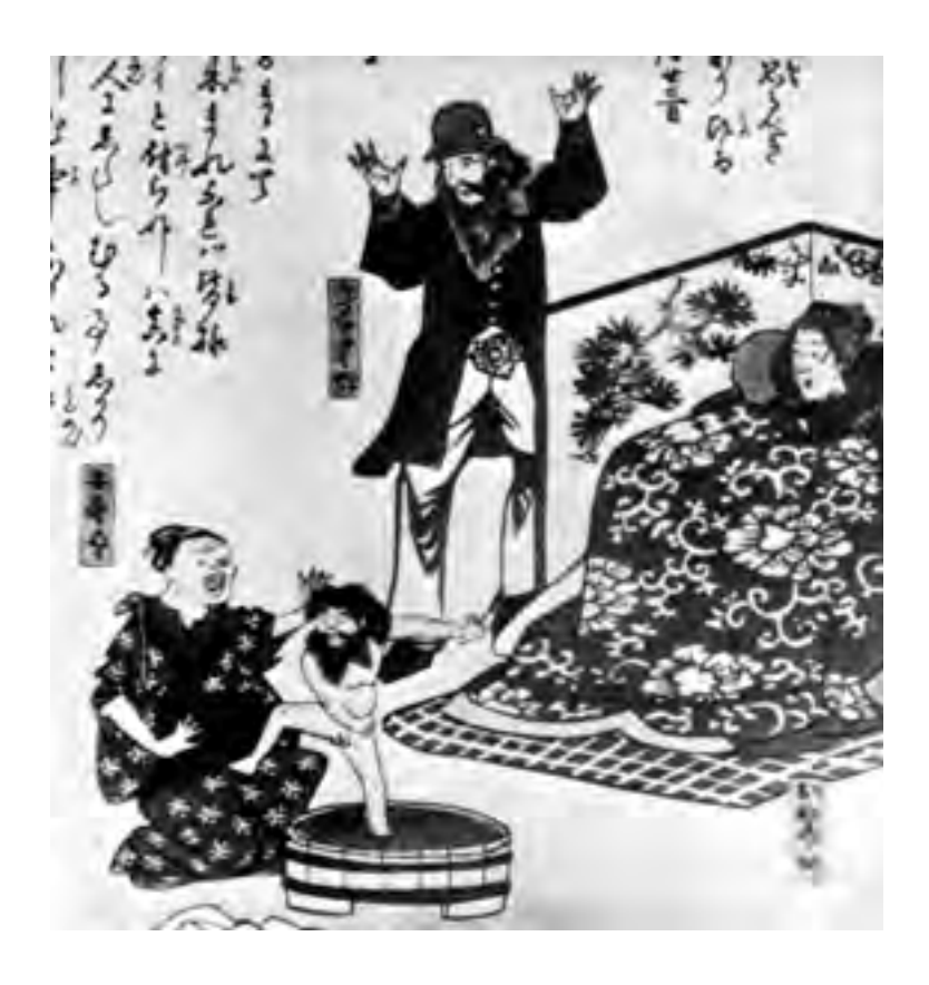
A Japanese drawing from the second half of the nineteenth century showing what would happen if Japanese women married Western men. The child is the result of the marriage.