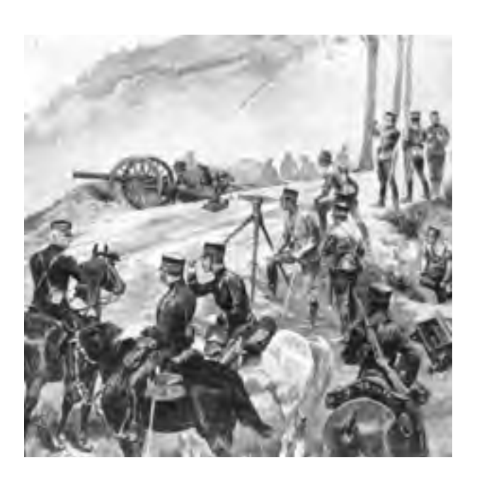
A drawing of Japanese soldiers in 1904.