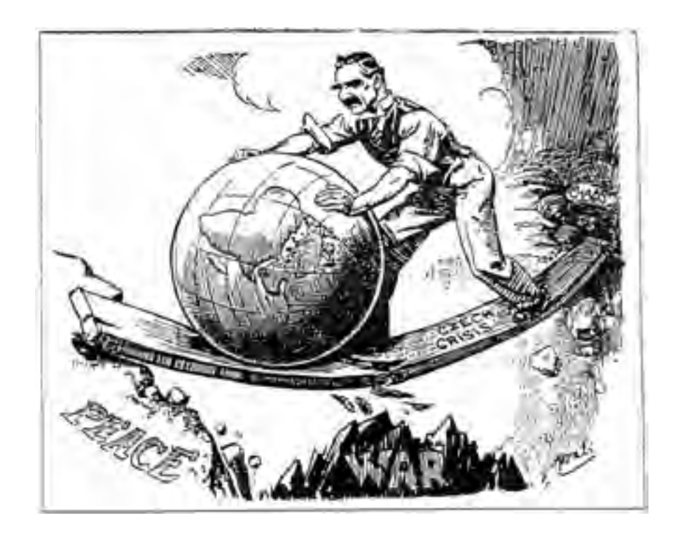
A cartoon published in a British newspaper on 25 September 1938.