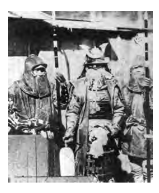
A photograph of Japanese warriors in 1868.