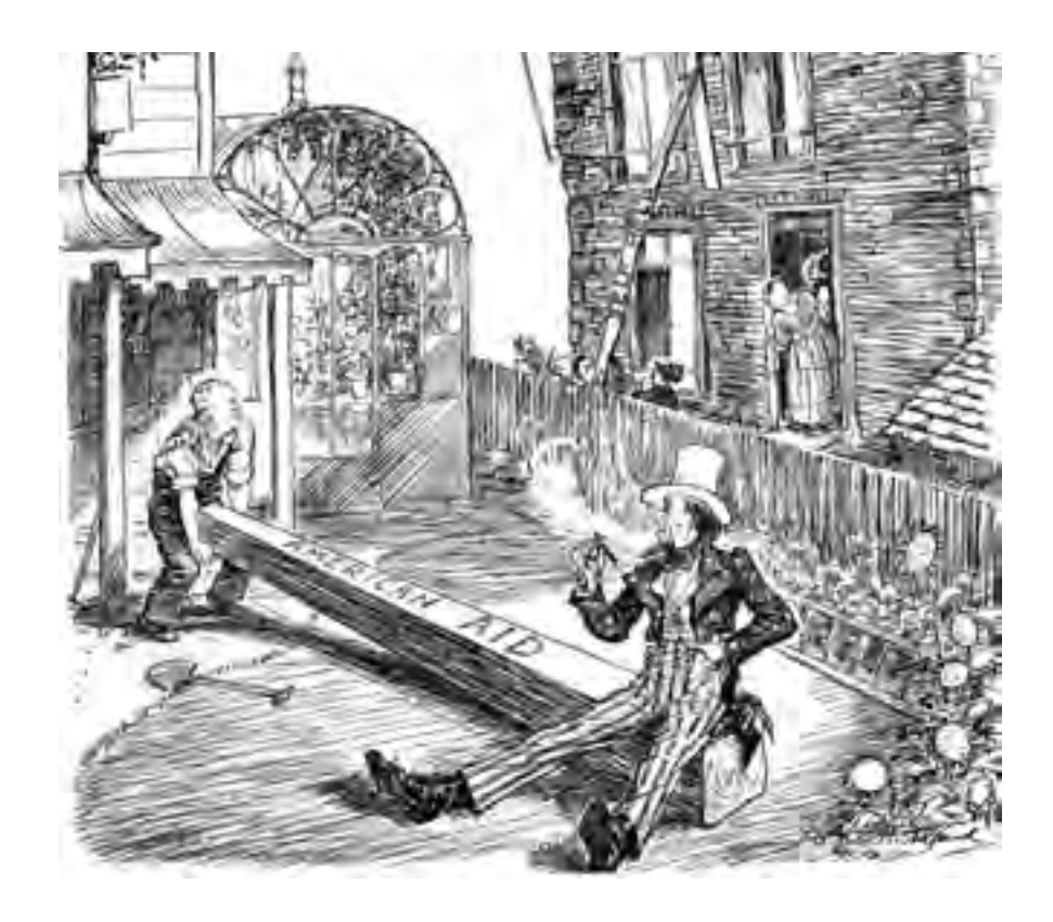
An American cartoon published in 1947. The man on the left is Marshall. He is saying 'Come on Sam! It's up to us again.'