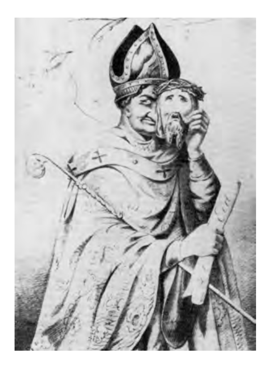
A cartoon drawing of Pope Pius IX from 1852.