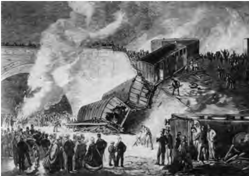
A print of a railway disaster near London in 1861.