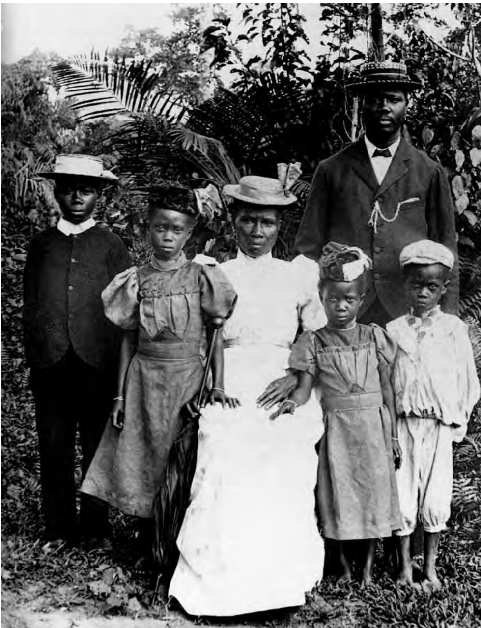
Photograph taken in 1898 of an African family who lived with Christian missionaries who wanted to show that Africans could be westernised.