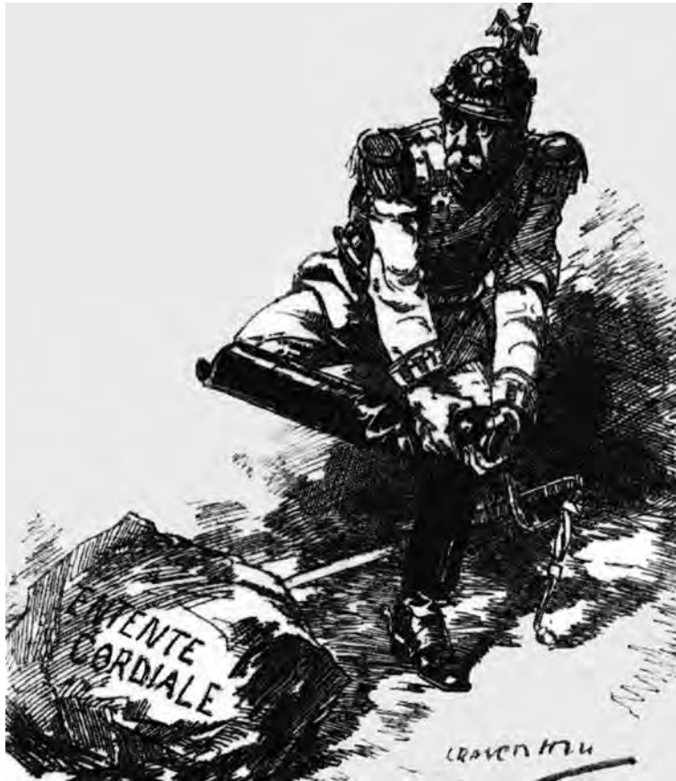
A British cartoon published in August 1911. The figure representing Germany is saying 'It's rock. I thought it was going to be paper.'