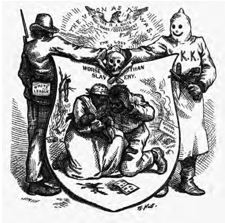
A cartoon from an American magazine published in 1874. The cartoon is called 'Worse than Slavery'.