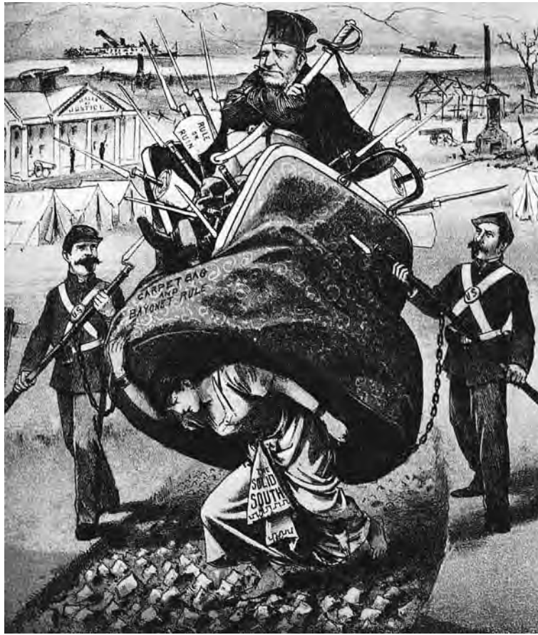
A cartoon published in 1880. The person sitting in the carpetbag is ex-President Grant, who was being considered by the Republicans as a Presidential candidate for the 1880 Presidential election.