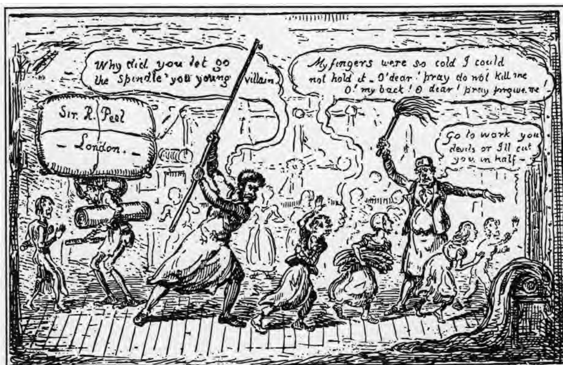
An early nineteenth century cartoon titled 'The Factory Slaves. Their daily employment'.

22 Study the cartoon, and then answer the questions which follow.