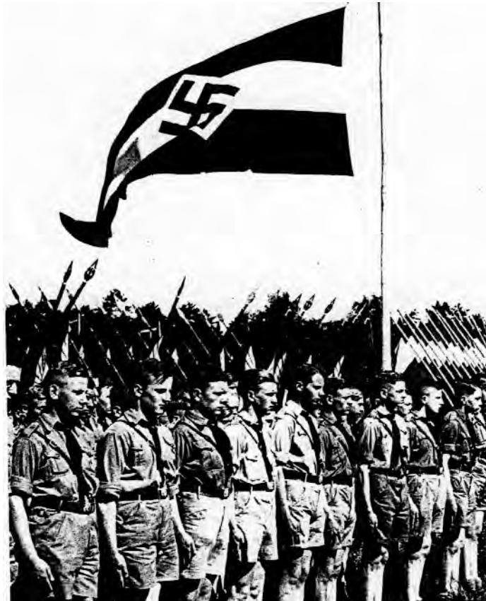
Members of the Hitler Youth on parade.

10 Study the photograph, and then answer the questions which follow.