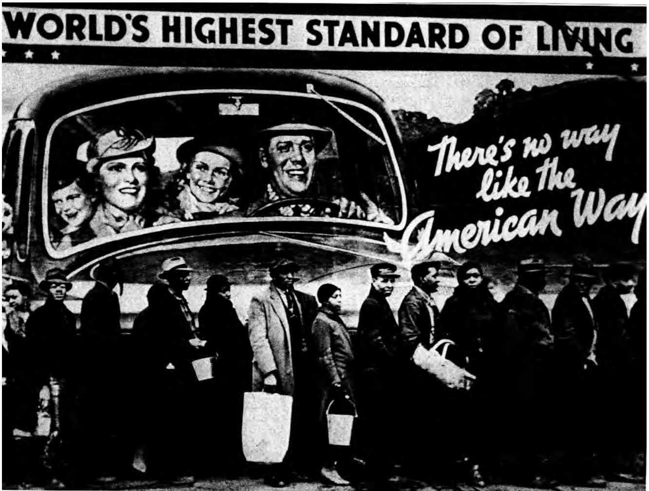
Unemployed people queuing for government relief in 1937.

14 Study the photograph, and then answer the questions which follow.