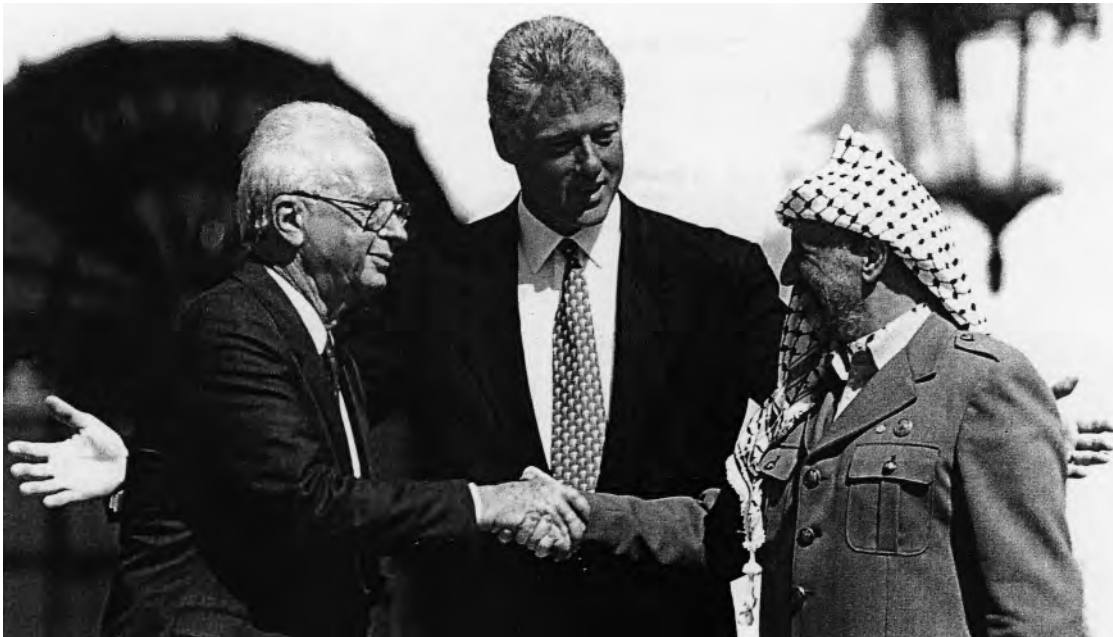
President Clinton with Rabin and Arafat after the signing of the Israeli-PLO peace accord, September 1993.

21 Study the photograph, and then answer the questions which follow.