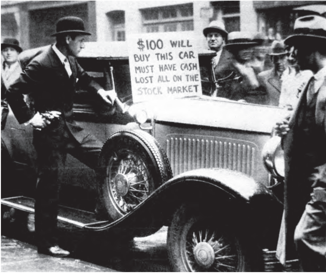
A victim of the stock market crash tries to sell his car for a bargain price, October 1929.

14 Study the photograph, and then answer the questions which follow.