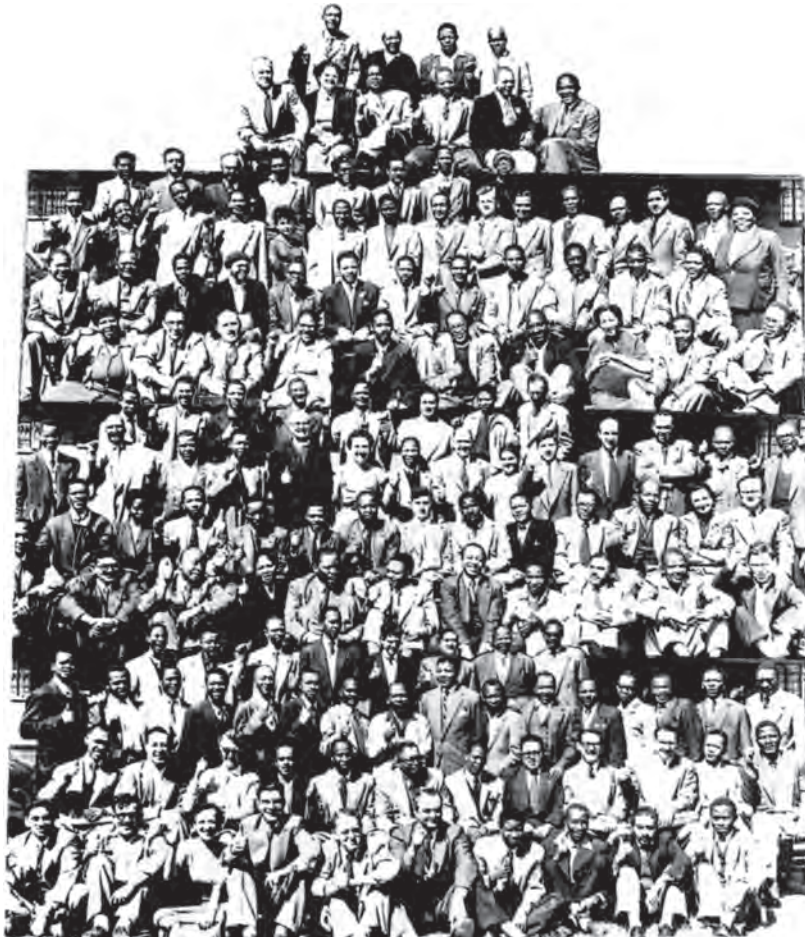
The accused at the start of the Treason Trials, December 1956.

18 Study the photograph, and then answer the questions which follow.