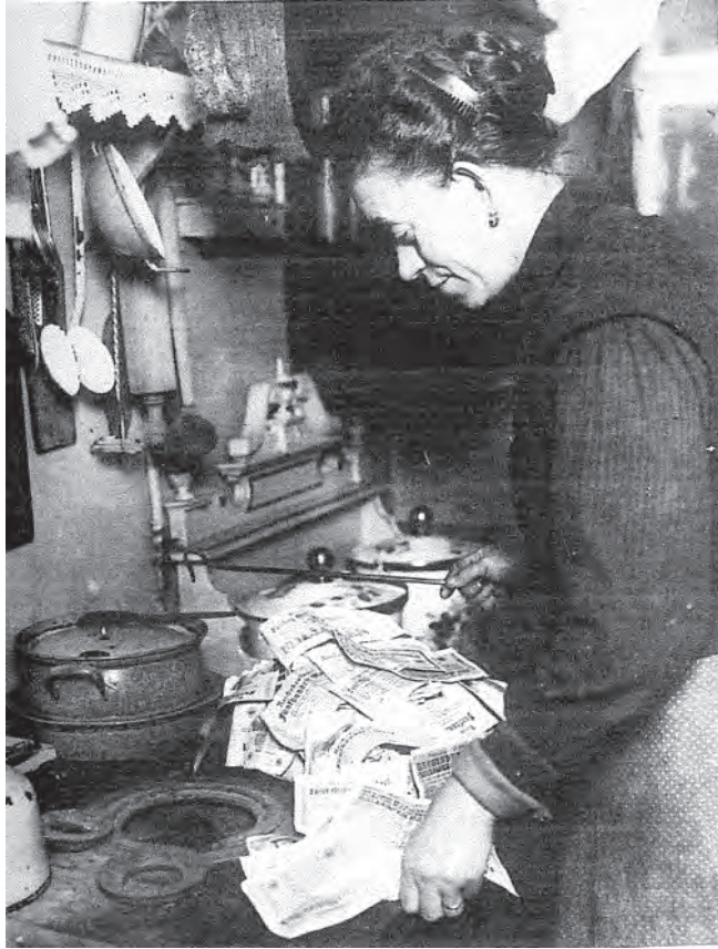
A woman using banknotes to start her fire in 1923.