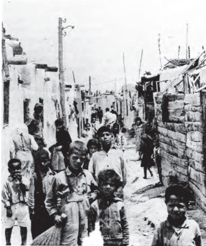
A street in a Palestinian refugee camp in 1966.

21 Study the photograph, and then answer the questions which follow.