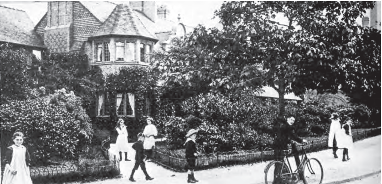
Workers' cottages built by Lever in the model village of Port Sunlight.

23 Study the photograph, and then answer the questions which follow.