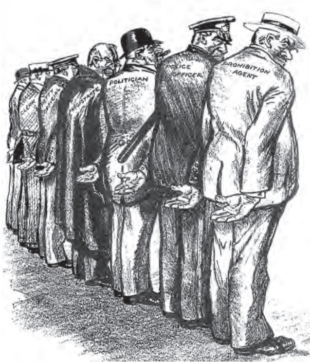
A cartoon from the Prohibition era entitled 'The National Gesture'.

13 Study the cartoon, and then answer the questions which follow.