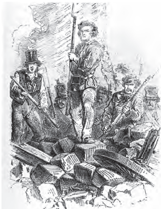
Paris during the 'June Days', 1848.