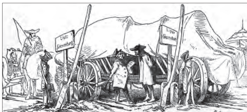
A German cartoon showing the collection of customs duties in 1834.