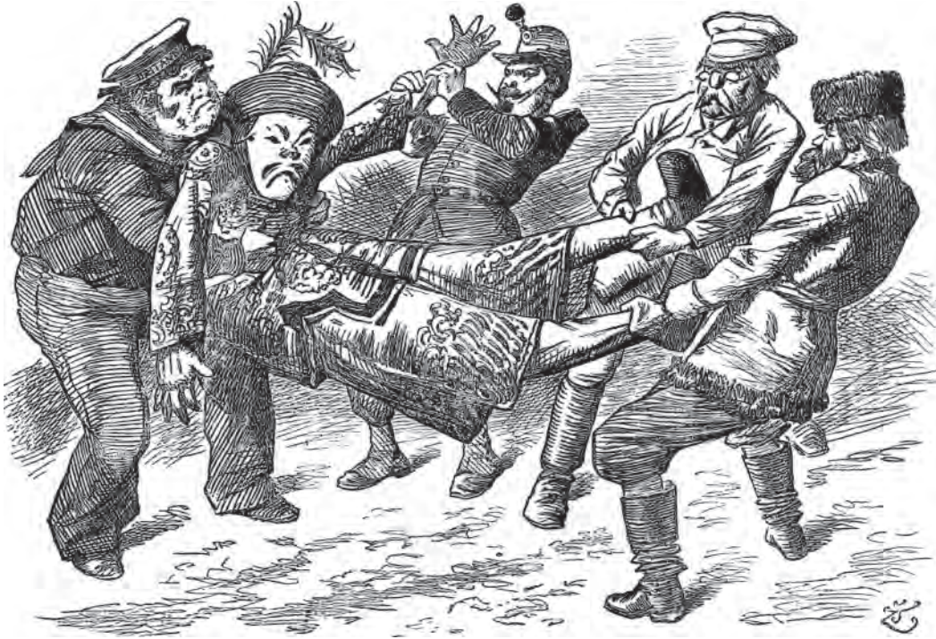
A cartoon showing foreign countries competing over China.

24 Study the cartoon, and then answer the questions which follow.