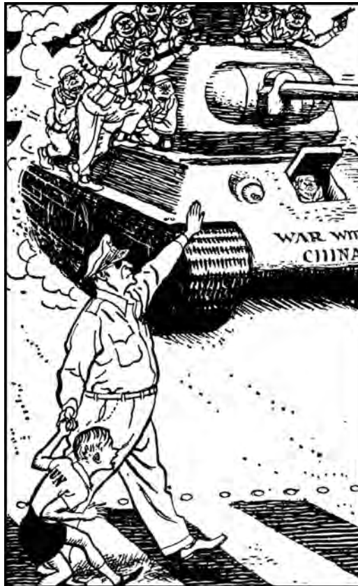
A cartoon from a British newspaper, November 1950. It shows General MacArthur ordering a South Korean tank to stop.