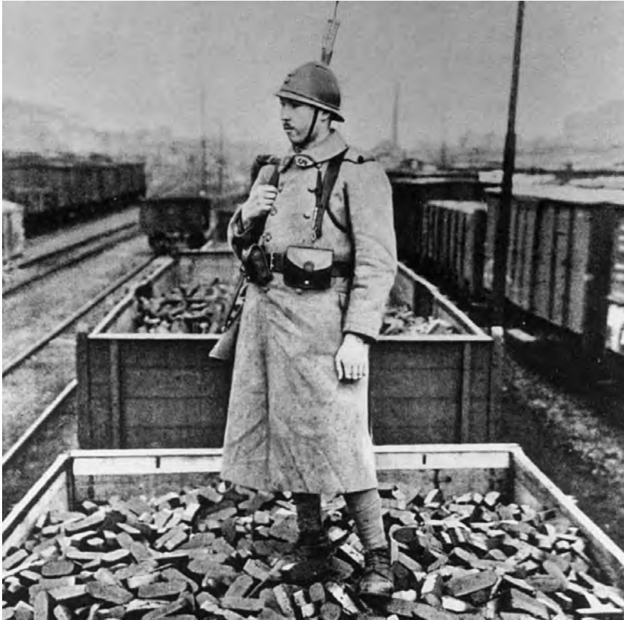
A French soldier guarding a train full of German coal from the Ruhr in 1923.