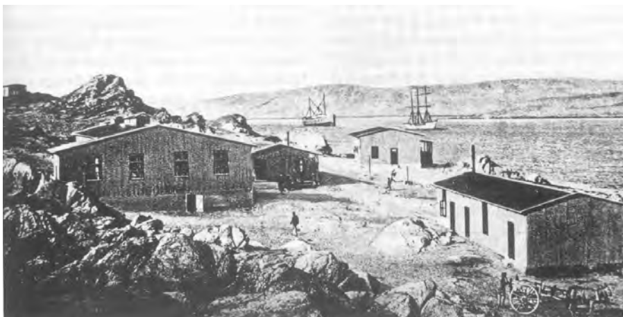
The German trading post at Angra Pequena, Namibia.

19 Study the illustration, and then answer the questions which follow.