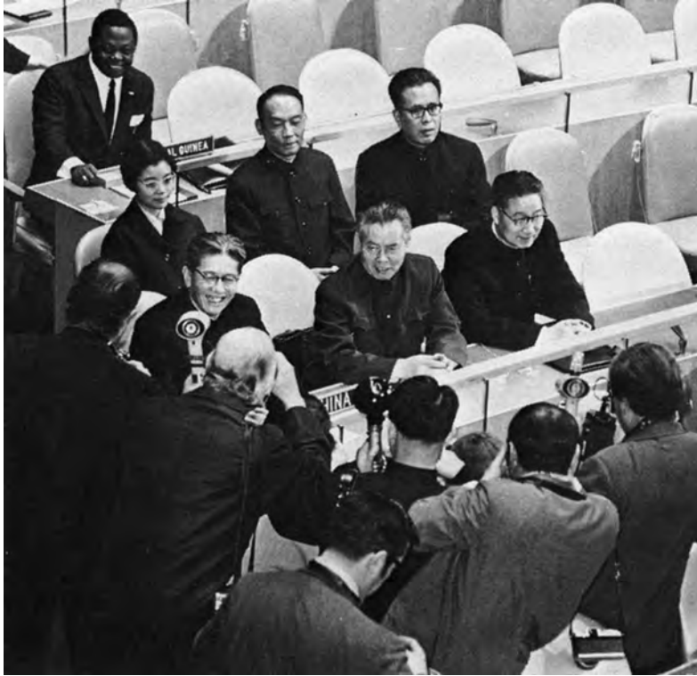
The delegation from the People's Republic of China taking their seats for the first time at the UN, 1971.

15 Study the photograph, and then answer the questions which follow.