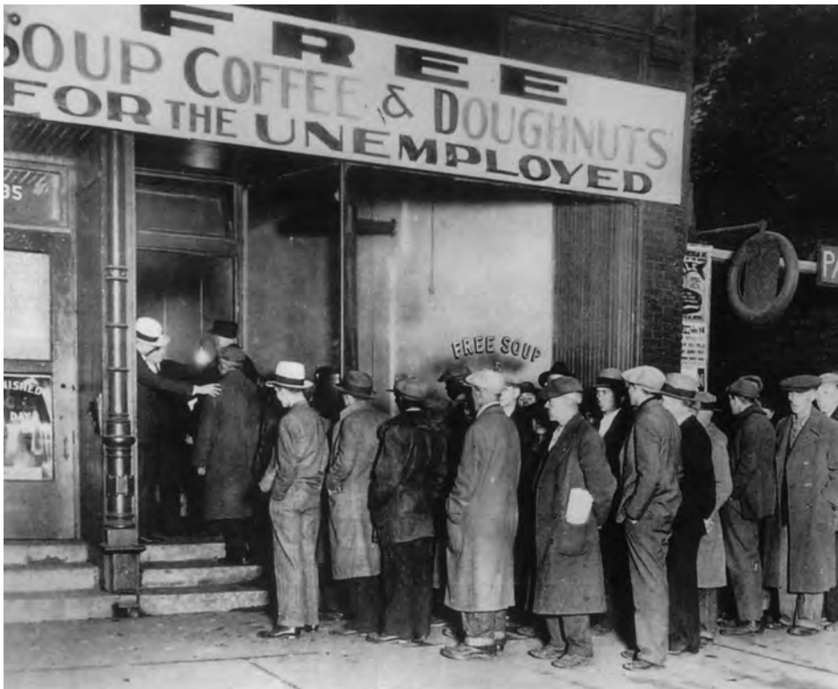
Unemployed people queuing at Al Capone's soup kitchen in Chicago in 1930.

13 Study the photograph, and then answer the questions which follow.