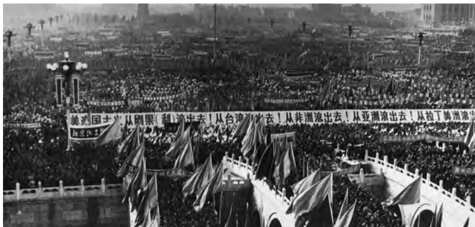
A rally of 700 000 Red Guards in Beijing in 1966.

16 Study the photograph, and then answer the questions which follow.