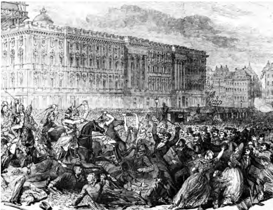
Prussian cavalry charging rioters in front of the Royal Palace, Berlin, 1848.