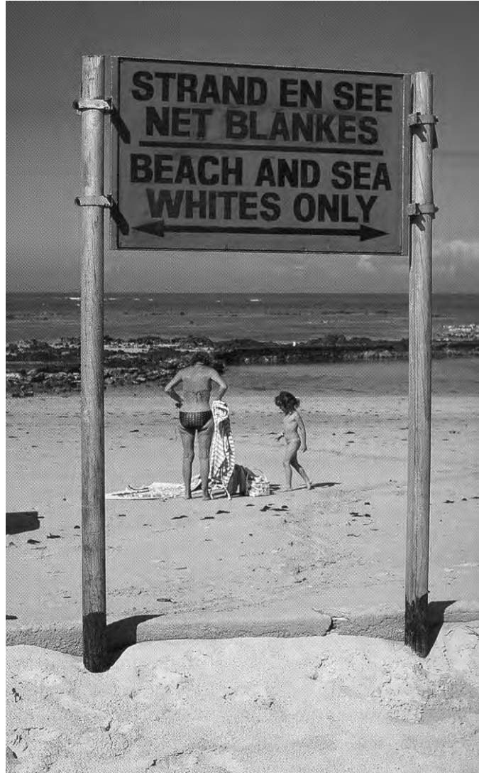
The Separate Amenities Law in action.

18 Study the photograph, and then answer the questions which follow.