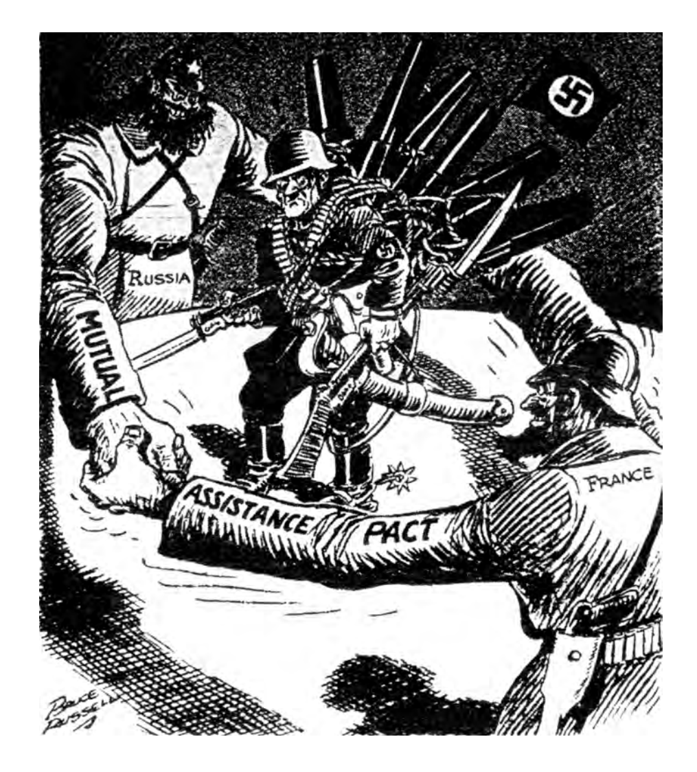
An American cartoon published in March 1936.