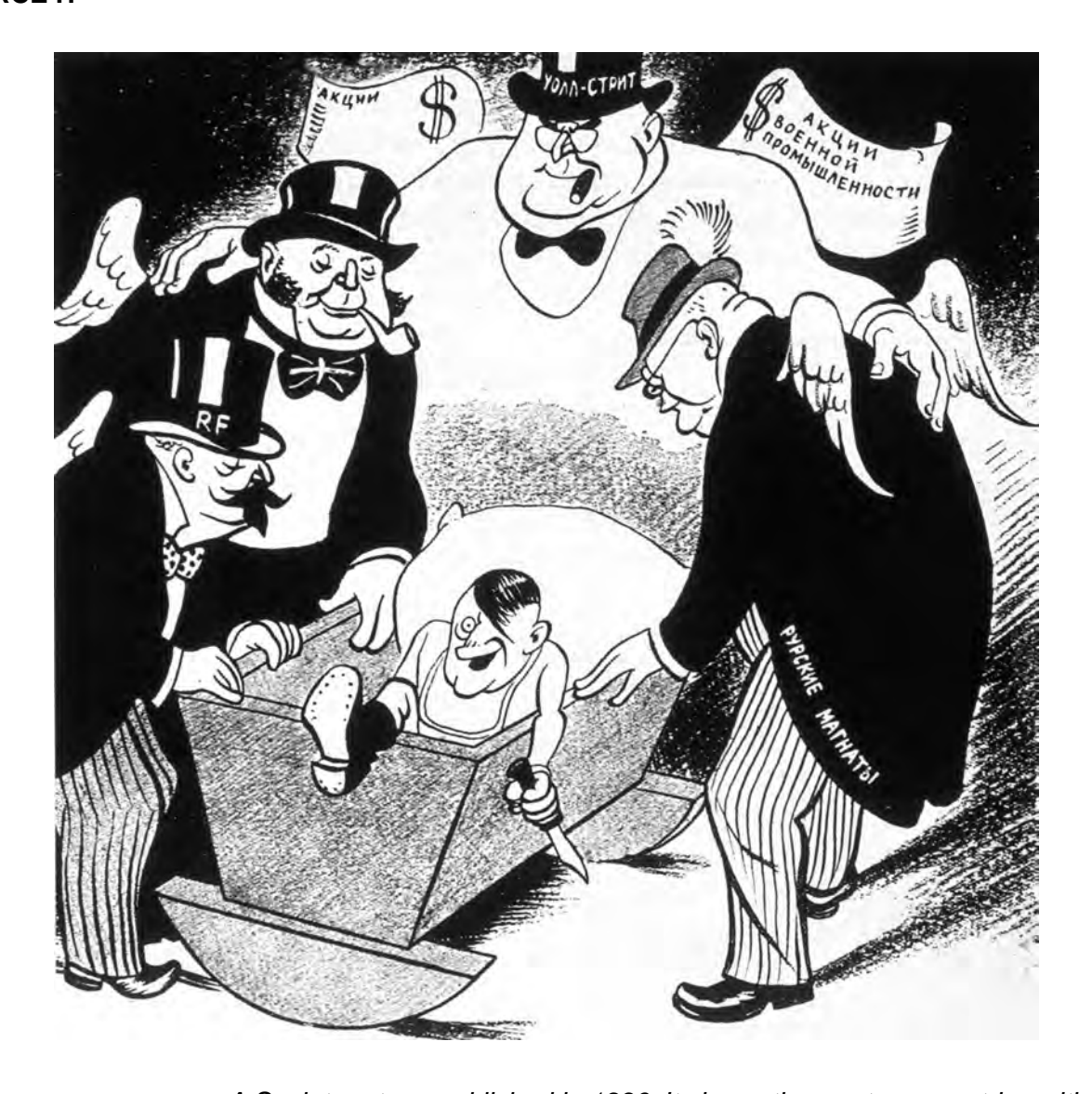
A Soviet cartoon published in 1936. It shows the western countries with Hitler.