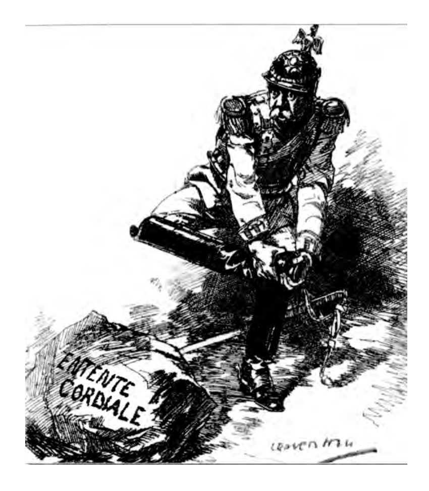
A cartoon about the Second Moroccan Crisis published in August 1911. The figure representing Germany is saying 'Oh No! It's rock. I thought it was going to be paper.'