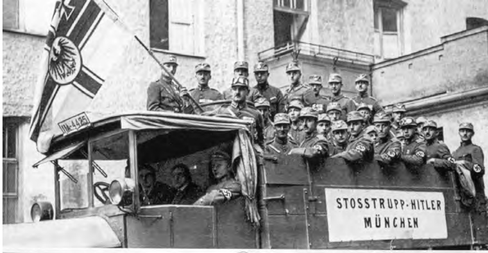
A group of SA members in Munich in 1923.