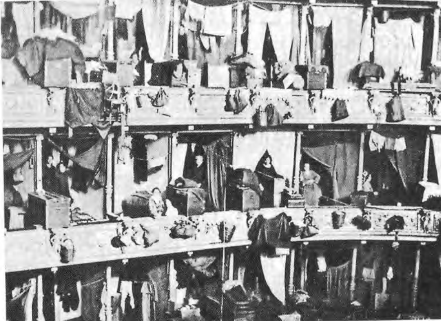
A League of Nations refugee camp.

5 Study the photograph, and then answer the questions which follow.