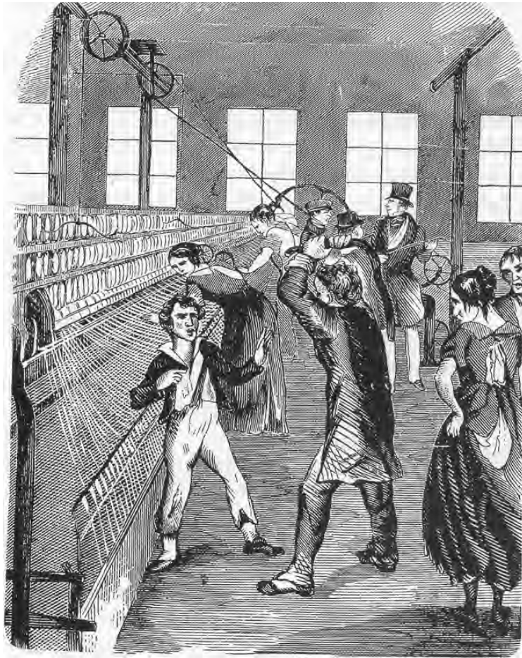
An engraving of workers in a cotton mill around 1840.

22 Study the illustration, and then answer the questions which follow.