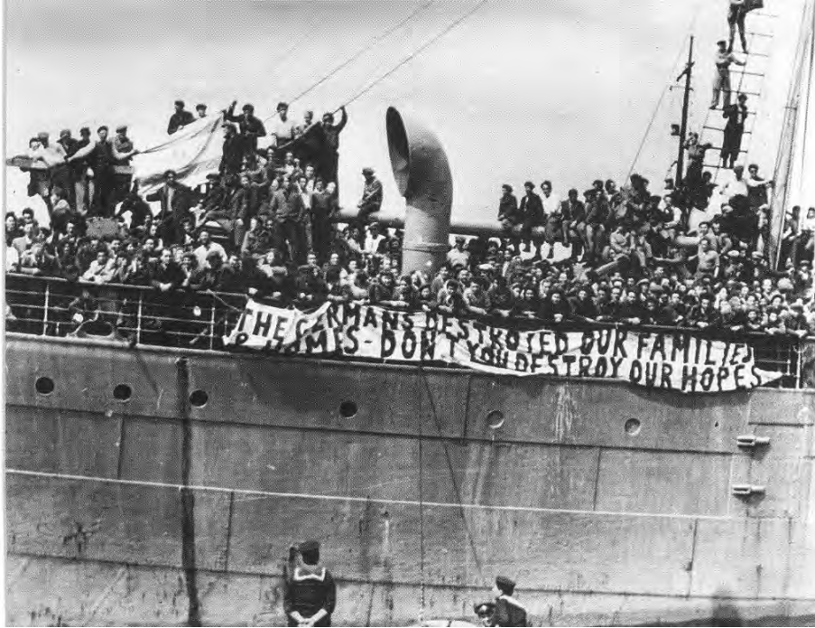
A refugee ship carrying Jewish immigrants arriving in Palestine in April 1947.

20 Study the photograph, and then answer the questions which follow.