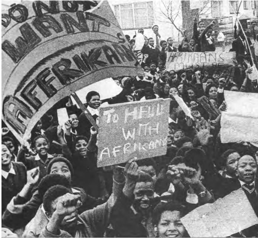
Students protesting about changes to education policy, 1976.

18 Study the photograph, and then answer the questions which follow.