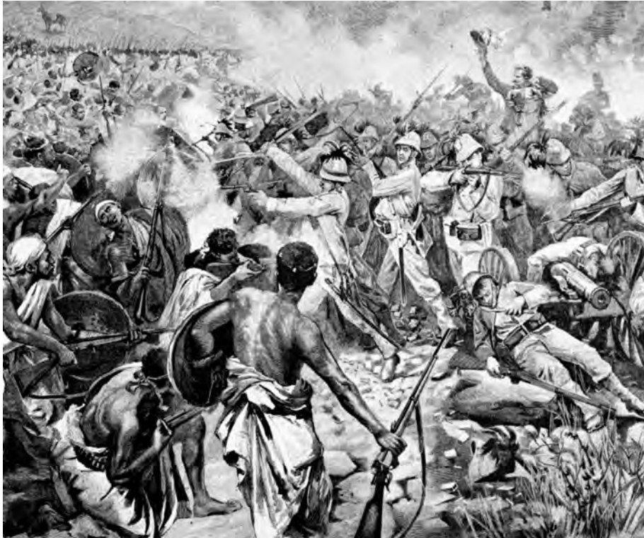
The battle of Adowa, 1896.

25 Study the illustration, and then answer the questions which follow.