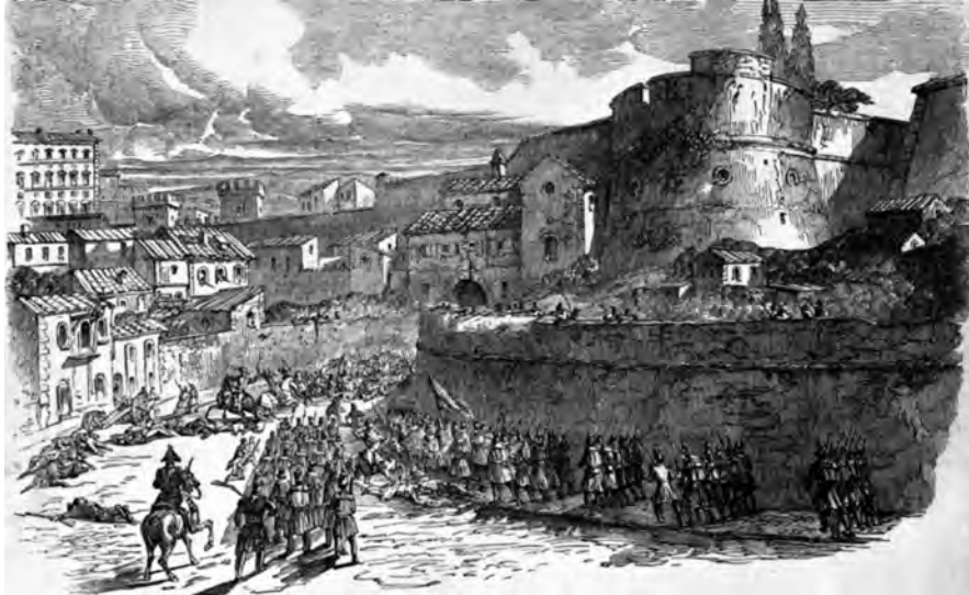
French troops recapturing Rome in 1849.