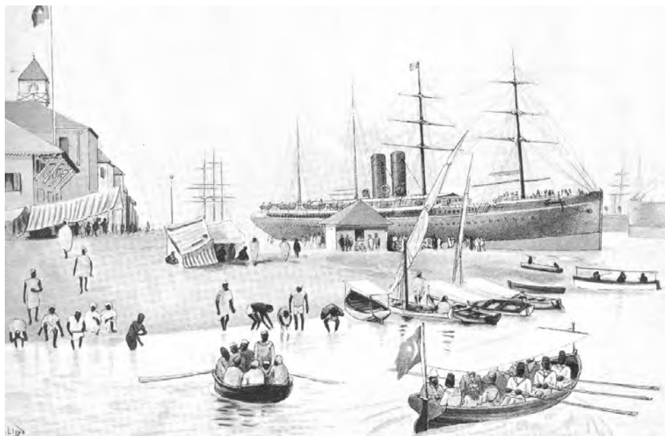
A British mail steamer entering the Suez Canal.

24 Study the illustration, and then answer the questions which follow.