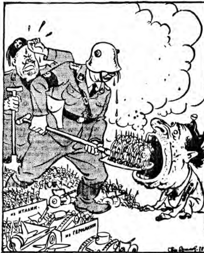
Рис. Бор. Ефимова.