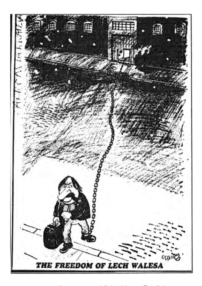
A cartoon published in an English newspaper in November 1982.