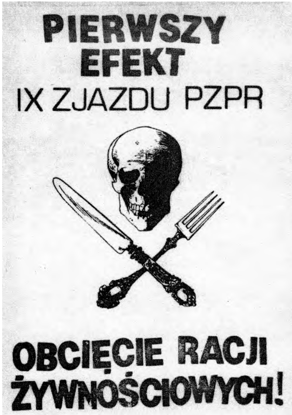
A poster published in Poland in 1981. It says 'The first result of the Ninth Communist Party Congress: a cut in food rations'.