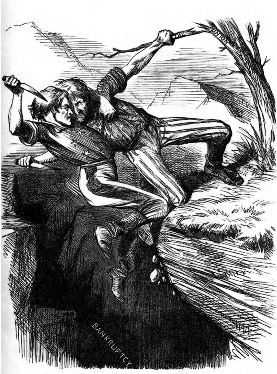
A cartoon from an English magazine, June 1862. The two figures represent the North and the South.