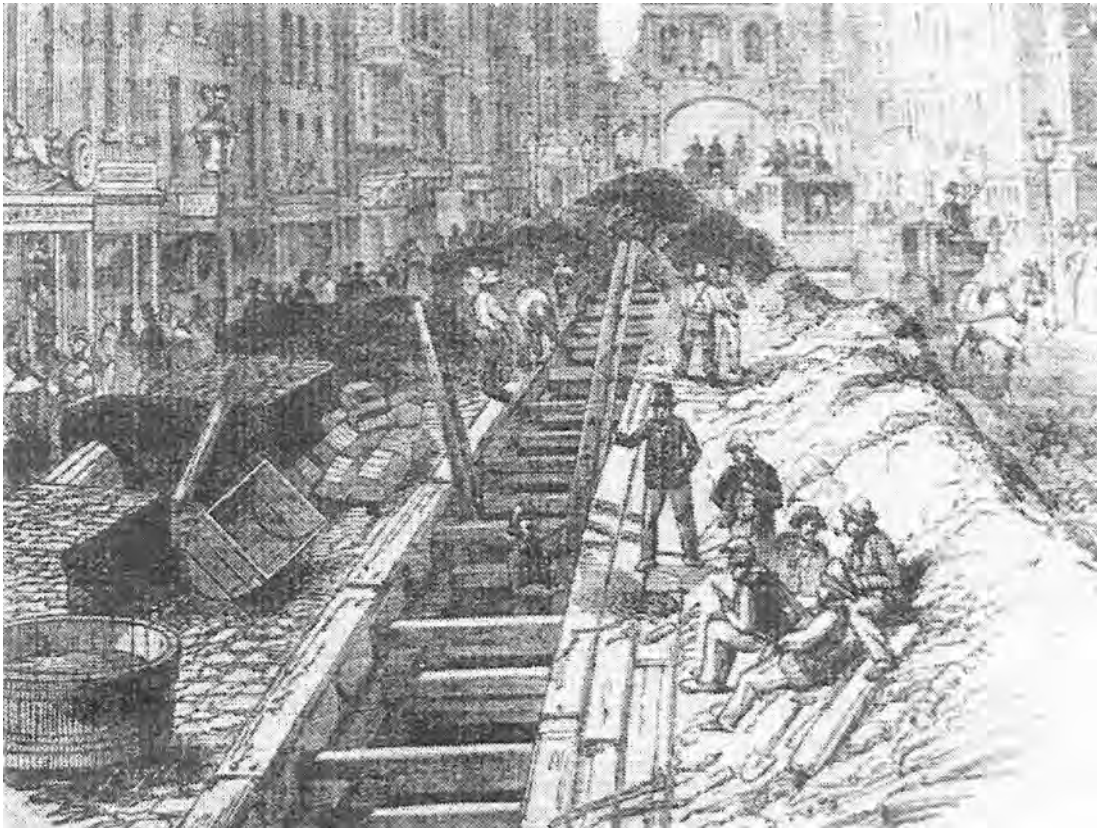
Building a sewer in London in 1844.

23 Study the illustration, and then answer the questions which follow.