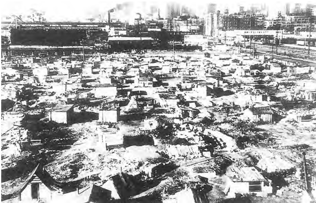
A Hooverville shanty town on wasteland in Seattle, Washington.

14 Study the photograph, and then answer the questions which follow.