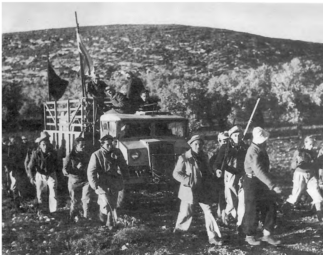
Jewish immigrants arriving in 1949 to build settlements on Palestinian land.

21 Study the photograph, and then answer the questions which follow.