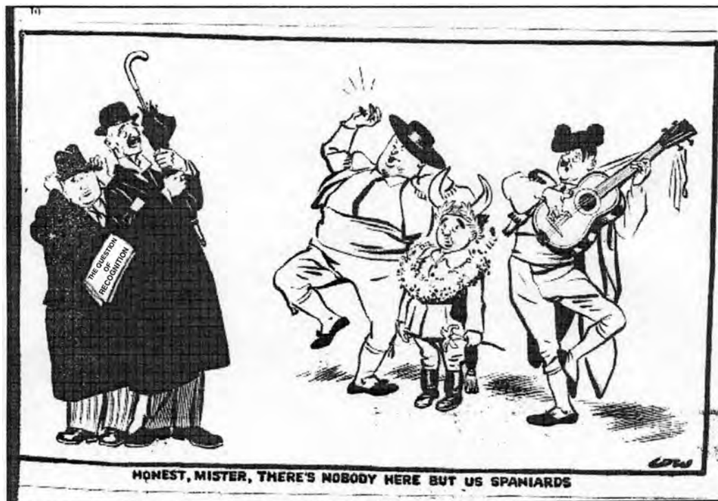
A cartoon published in Britain in February 1939. The figures on the left represent the British and French Governments. The figures on the right are Mussolini, Franco and Hitler.