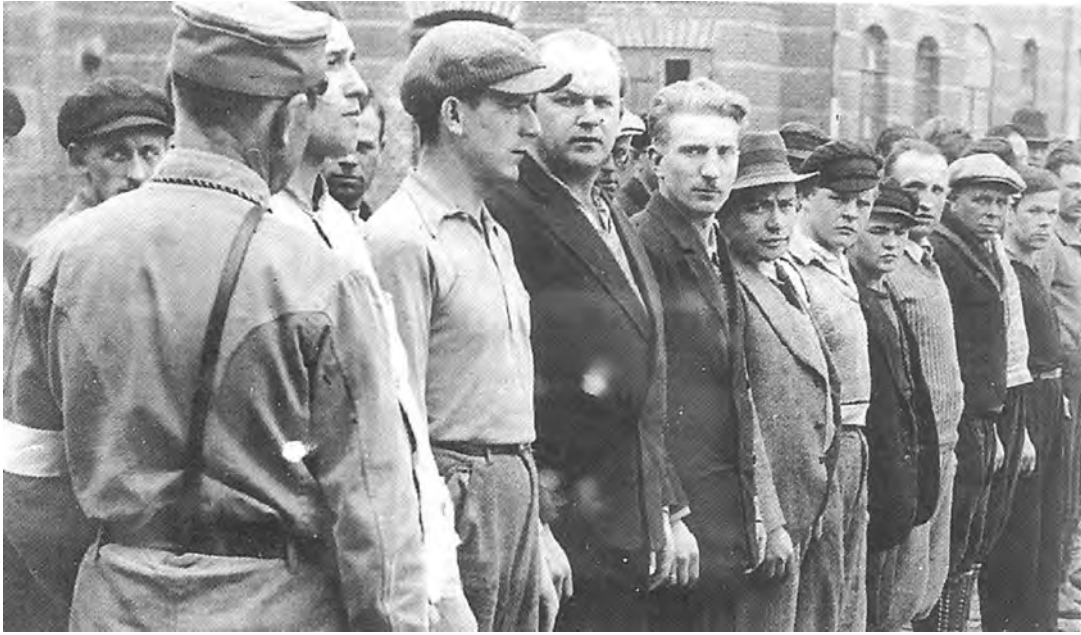
Political prisoners at the Oranienburg concentration camp near Berlin.

10 Study the photograph, and then answer the questions which follow.