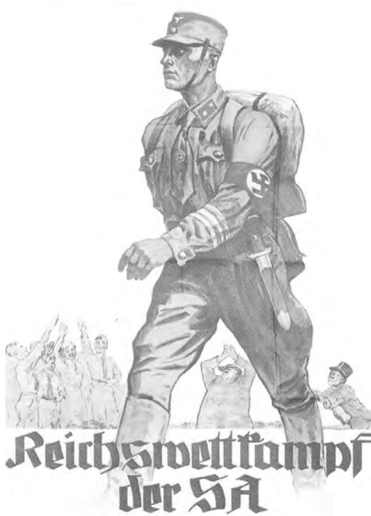
A Nazi propaganda poster about the SA.