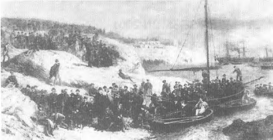
Garibaldi's expedition landing in Sicily.