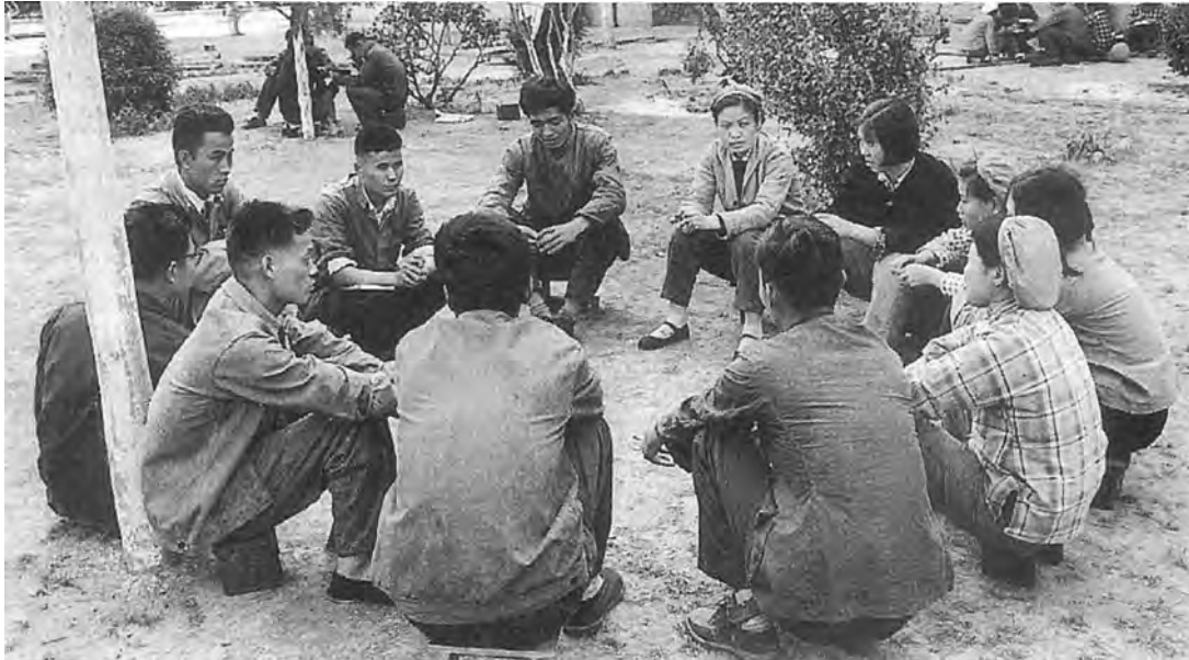
Chinese citizens taking part in a 'thought reform' meeting.

16 Study the photograph, and then answer the questions which follow.