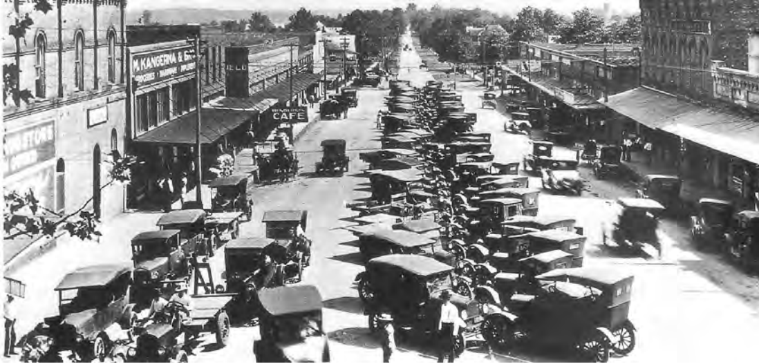
A street in Texas in 1925.

13 Study the photograph, and then answer the questions which follow.