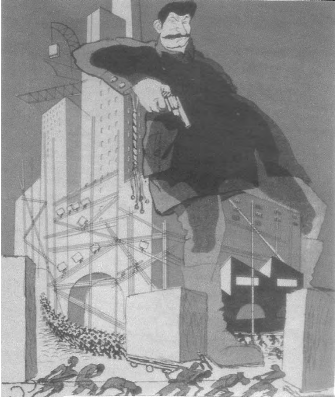
A cartoon published in France by opponents of Stalin in the late 1930s.

12 Study the cartoon, and then answer the questions which follow.