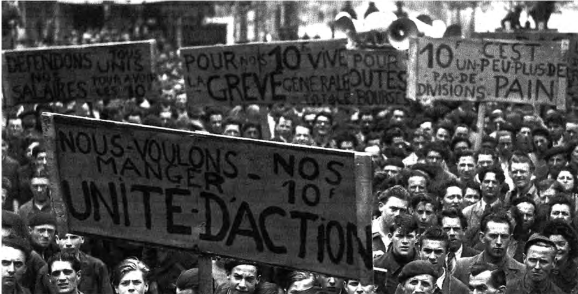
A photograph of workers in Paris demonstrating in 1947 for more pay, more bread and more united action by left-wing groups.