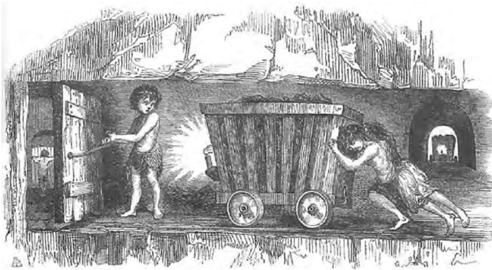
An illustration from the 1842 Report of the Royal Commission on conditions in coal mines.

22 Look at the illustration, and then answer the questions which follow.