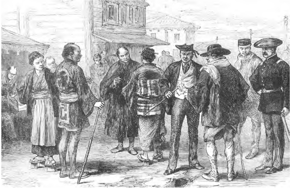
Japanese people wearing traditional and western costumes in 1873.

3 Look at the illustration, and then answer the questions which follow.