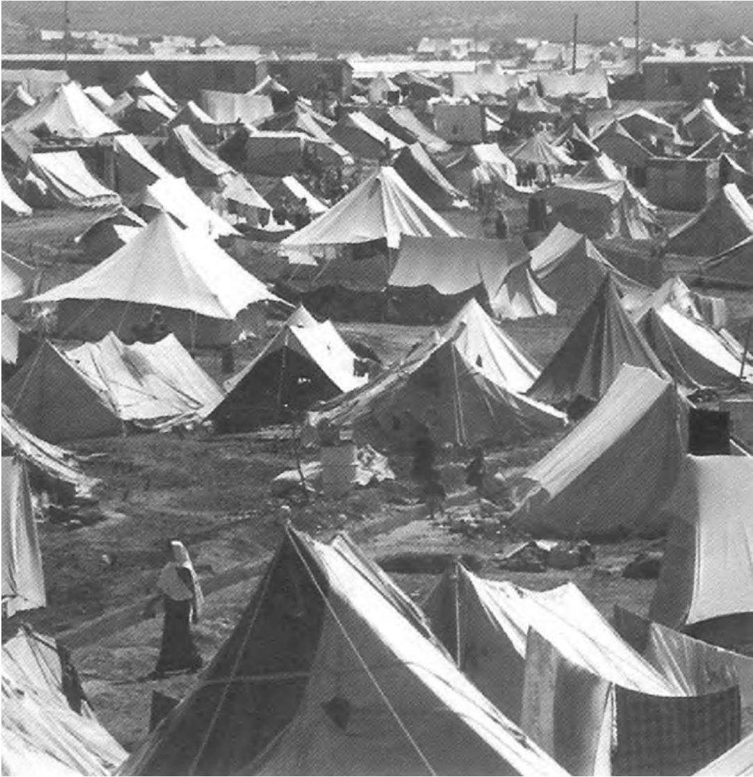
A photograph of a Palestinian refugee camp in Jordan, 1949.

21 Look at the photograph, and then answer the questions which follow.