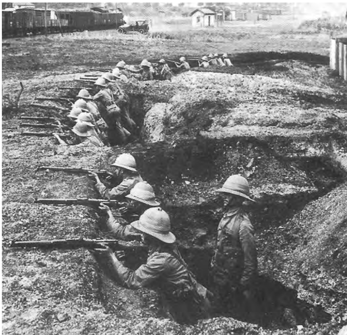
Government soldiers facing striking mine-workers in Johannesburg, 1922.

17 Look at the photograph, and then answer the questions which follow.