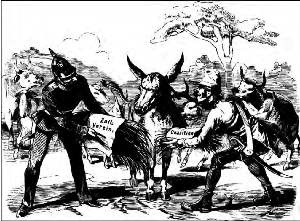
A cartoon from a German magazine published in 1852. The man on the left represents Prussia while the man on the right represents Austria. The animals represent those German states that did not belong to the Zollverein.