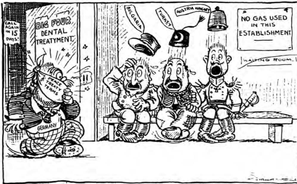
THEIR TURN NEXT.

A cartoon published in an English newspaper in May 1919.