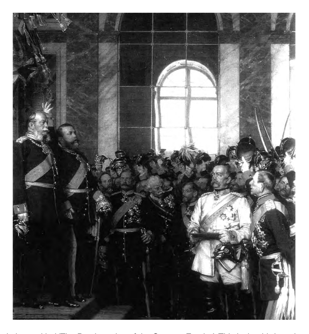
A painting entitled 'The Proclamation of the German Empire'. This is the third version of this painting and was painted in 1885 to celebrate Bismarck's seventieth birthday. The original version was painted in 1871 and showed the occasion as dull, with Bismarck in a less important position. In this version Bismarck is the figure in white.