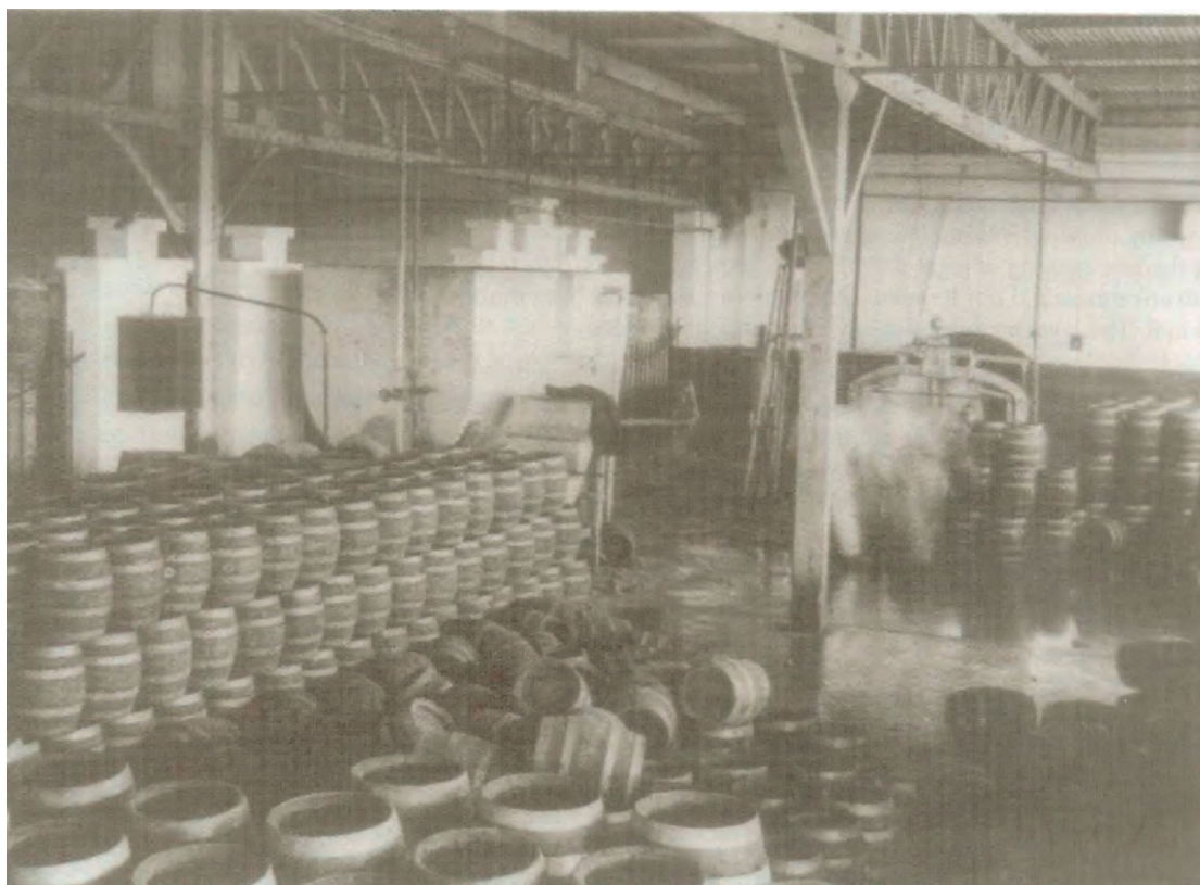
A photograph of an illegal still.