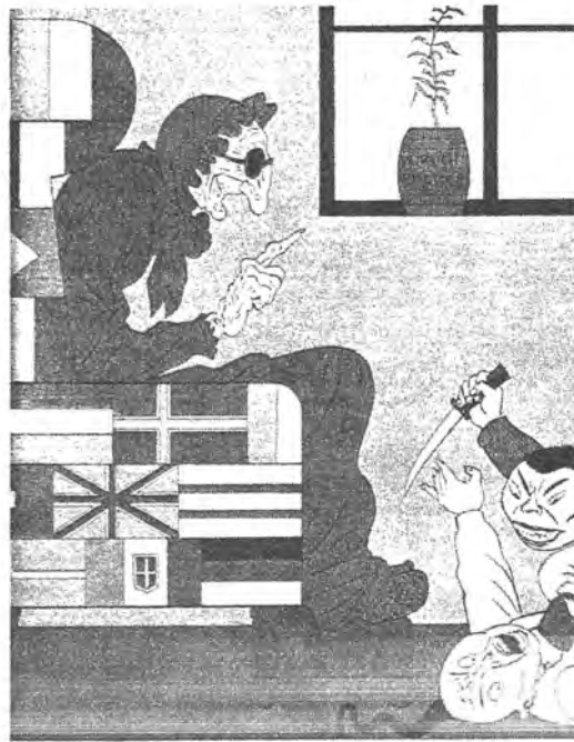
A cartoon published in Germany in January 1933. The League (on the left) is saying 'Naughty Japan! You should warn me next time you want to start a little war.'