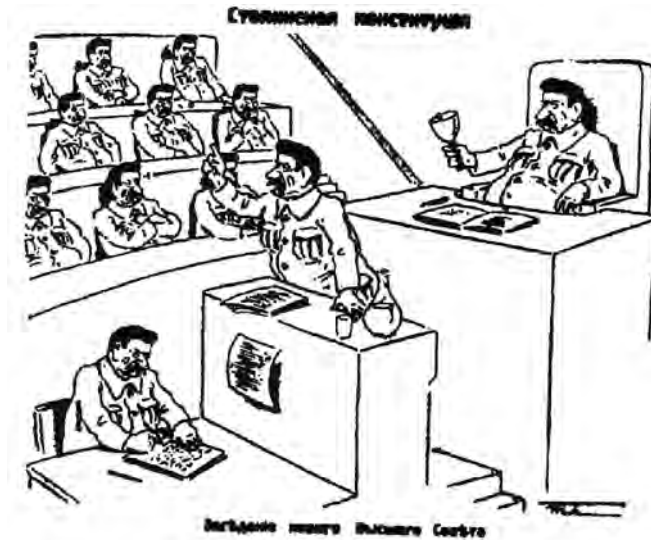
A cartoon published by Russian exiles in Paris, 1936. The cartoon's title is 'The Stalinist Constitution.' The text at the bottom reads 'New seating arrangements in the Supreme Soviet.'