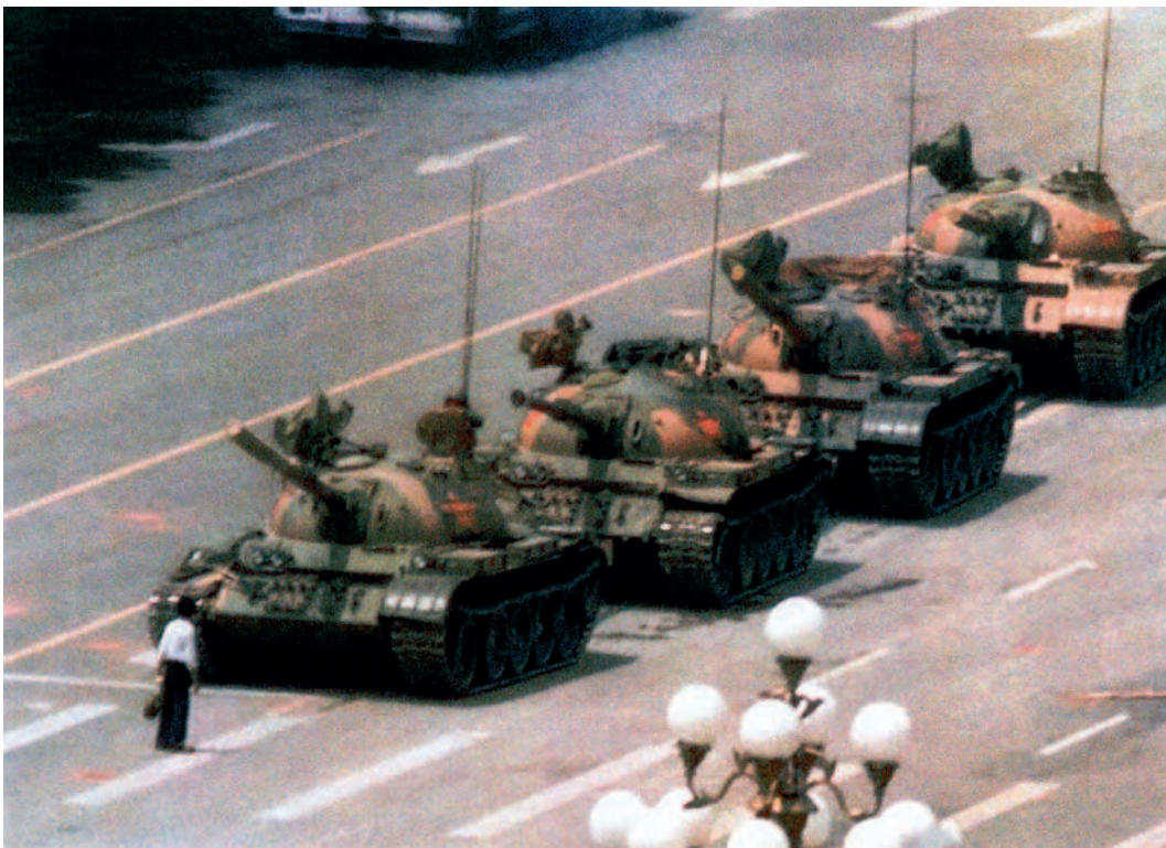
A photograph of tanks in Tiananmen Square, Beijing, June 1989.

16 Look at the photograph, and then answer the questions which follow.