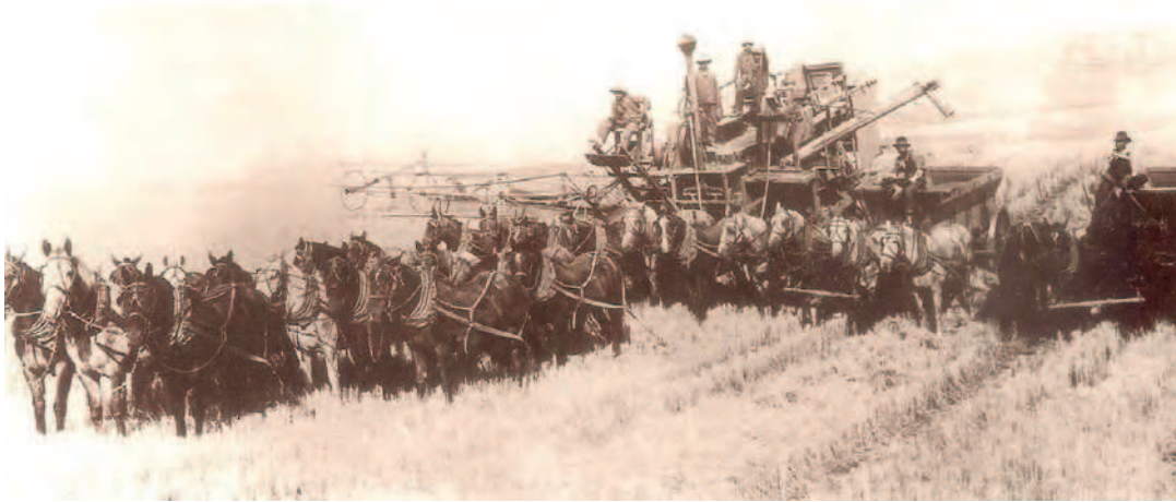
A photograph of recently introduced harvesting machinery on a farm in 1923.