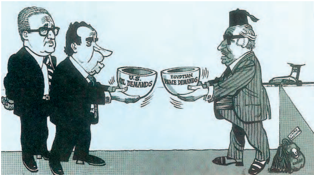
A cartoon published in a British newspaper in 1973. It shows Henry Kissinger and President Nixon negotiating with Egypt.

20 Look at the cartoon, and then answer the questions which follow.