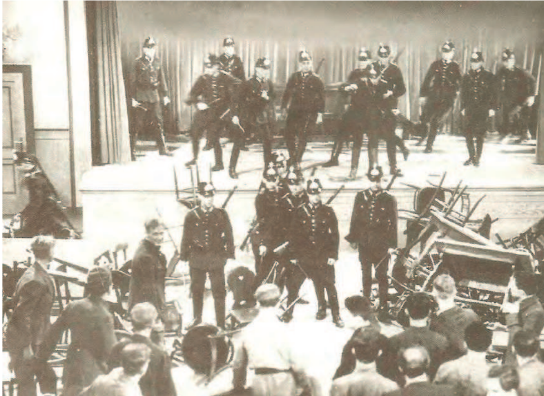
A photograph of the police dealing with the aftermath of a fight between the SA and the Communists, 1932.