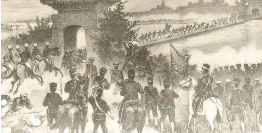
A painting of Japanese troops capturing Pyongyang in Korea during the war with China in 1894–5.