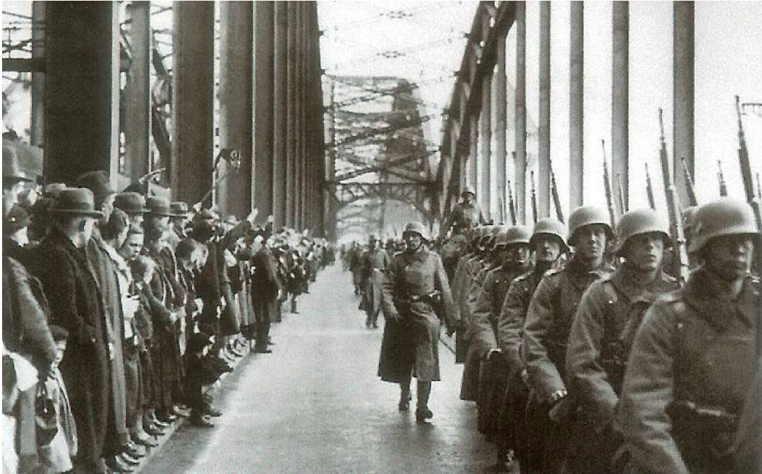
A photograph of German forces crossing the Cologne Bridge to enter the Rhineland in 1936.