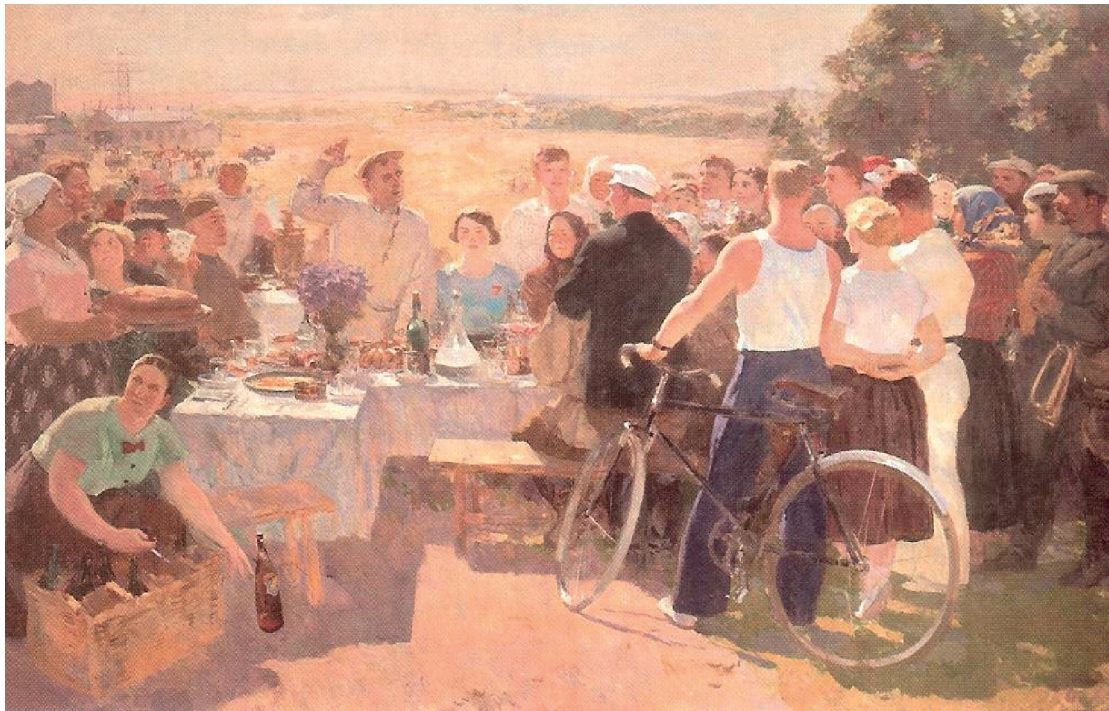
A Soviet painting from 1937, showing life on a collective farm.

12 Look at the painting, and then answer the questions which follow.