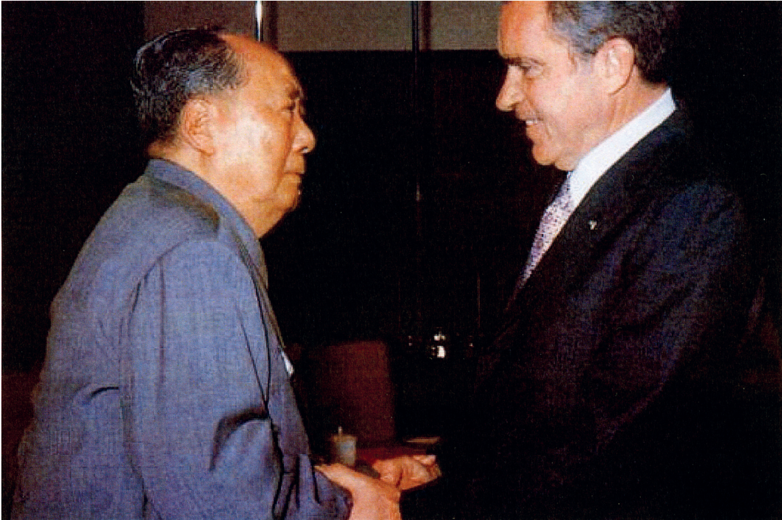
A photograph of Mao meeting with US President Nixon in 1972.

16 Look at the photograph, and then answer the questions which follow.