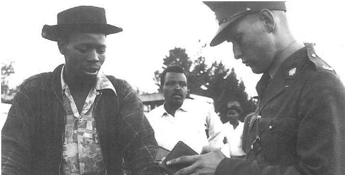
A photograph of a policeman inspecting the pass belonging to a black South African.

18 Look at the photograph, and then answer the questions which follow.