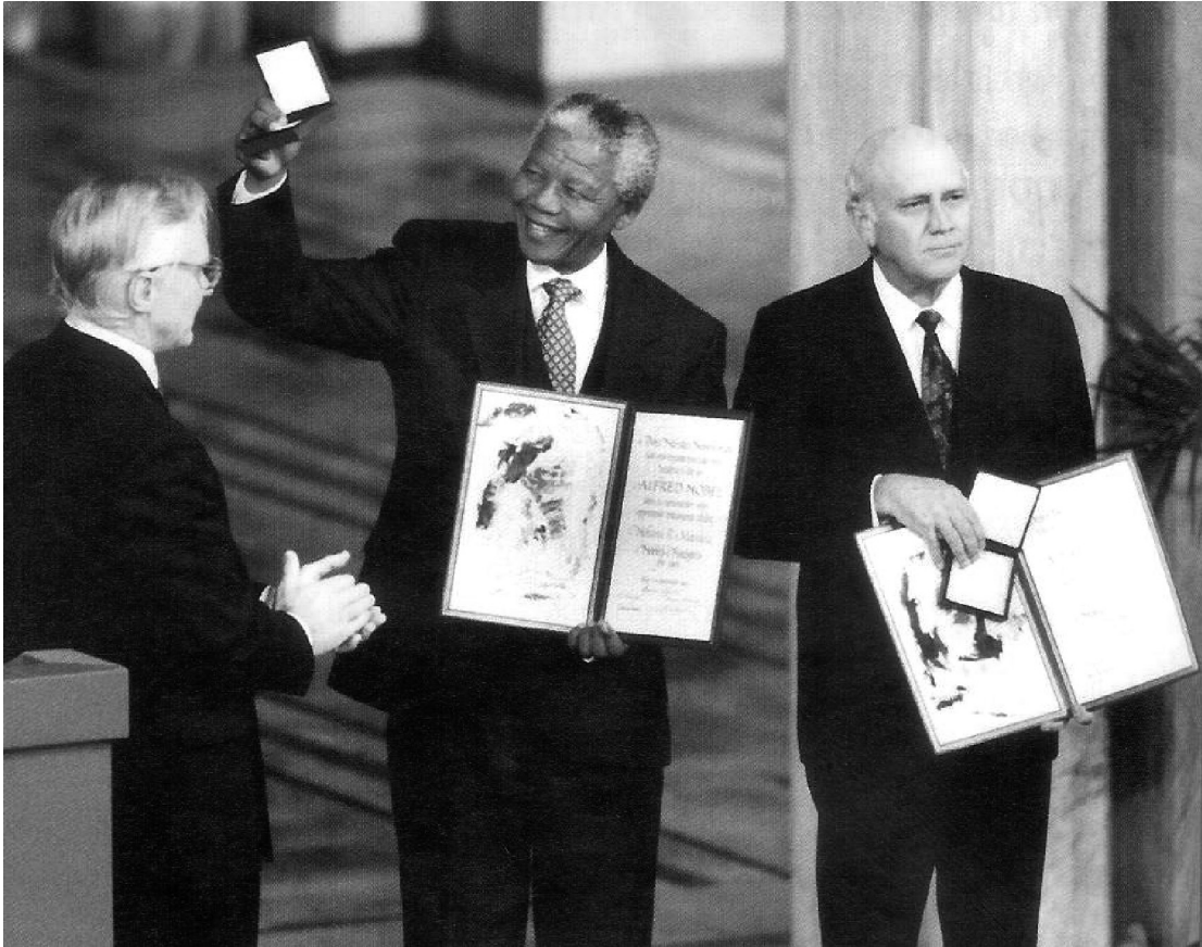
A photograph of Mandela and De Klerk receiving the Nobel Peace Prize in 1993.

18 Look at the photograph, and then answer the questions which follow.