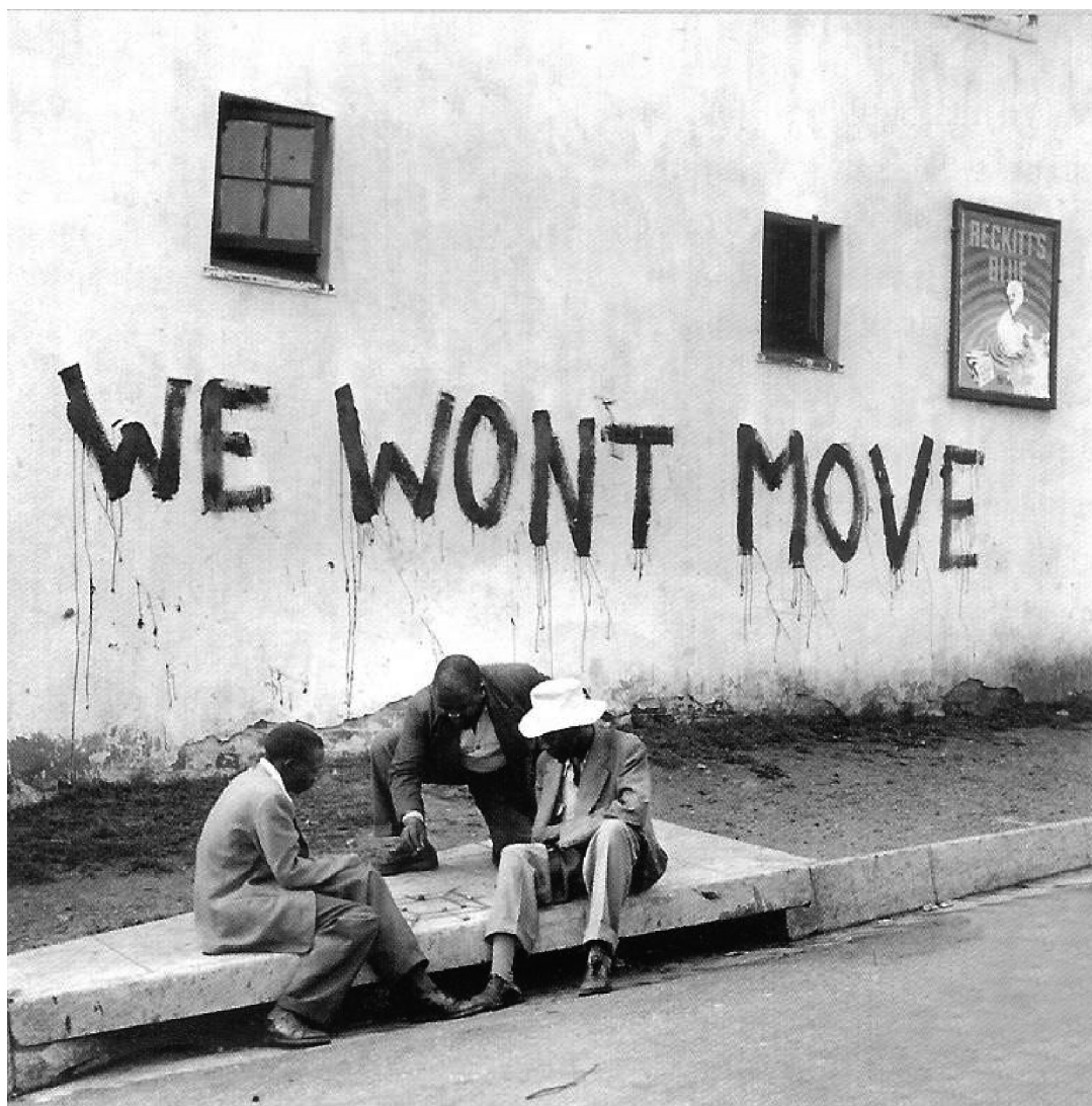
A photograph of the outside of a house in Sophiatown, 1955.

17 Look at the photograph, and then answer the questions which follow.