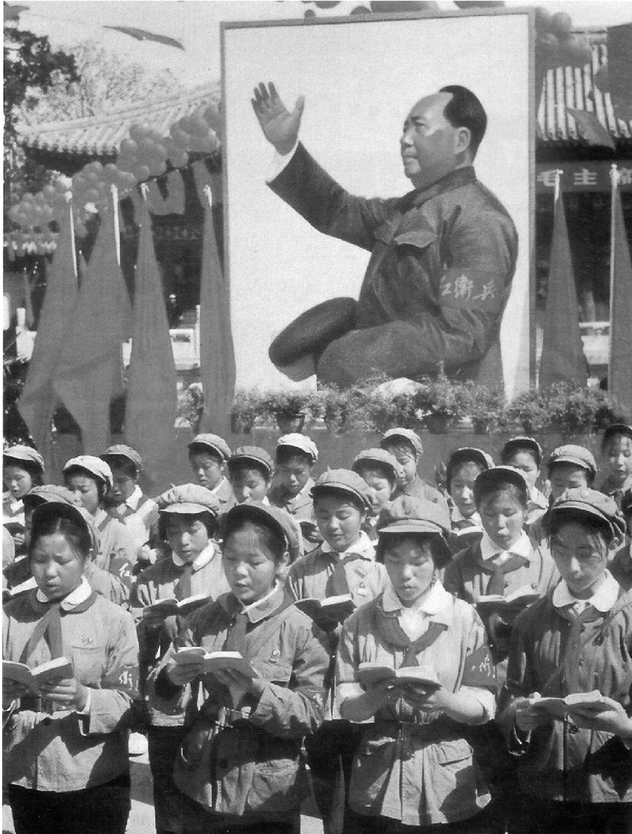
A photograph of Red Guards during the Cultural Revolution.

16 Look at the photograph, and then answer the questions which follow.