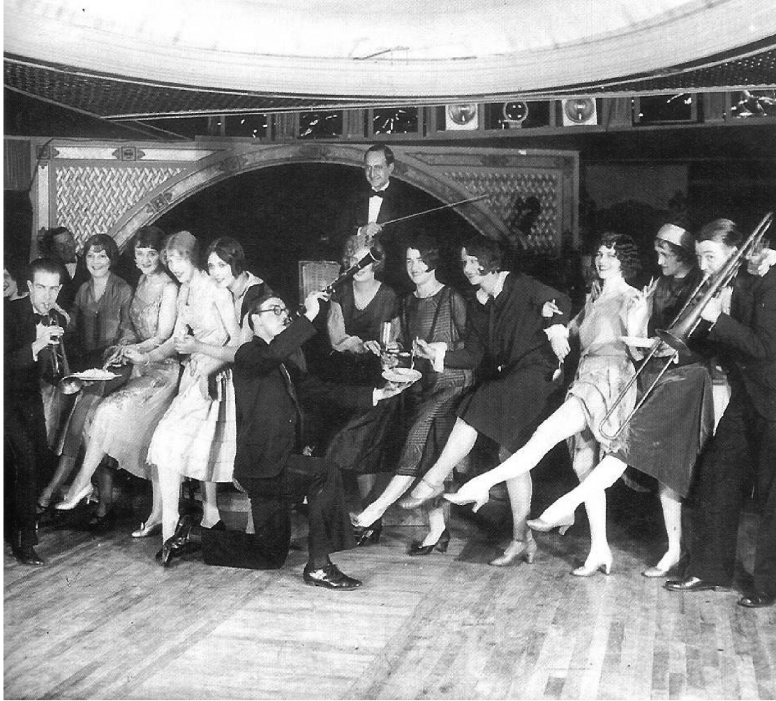
A photograph of young women dancing in 1920s America.

13 Look at the photograph, and then answer the questions which follow.