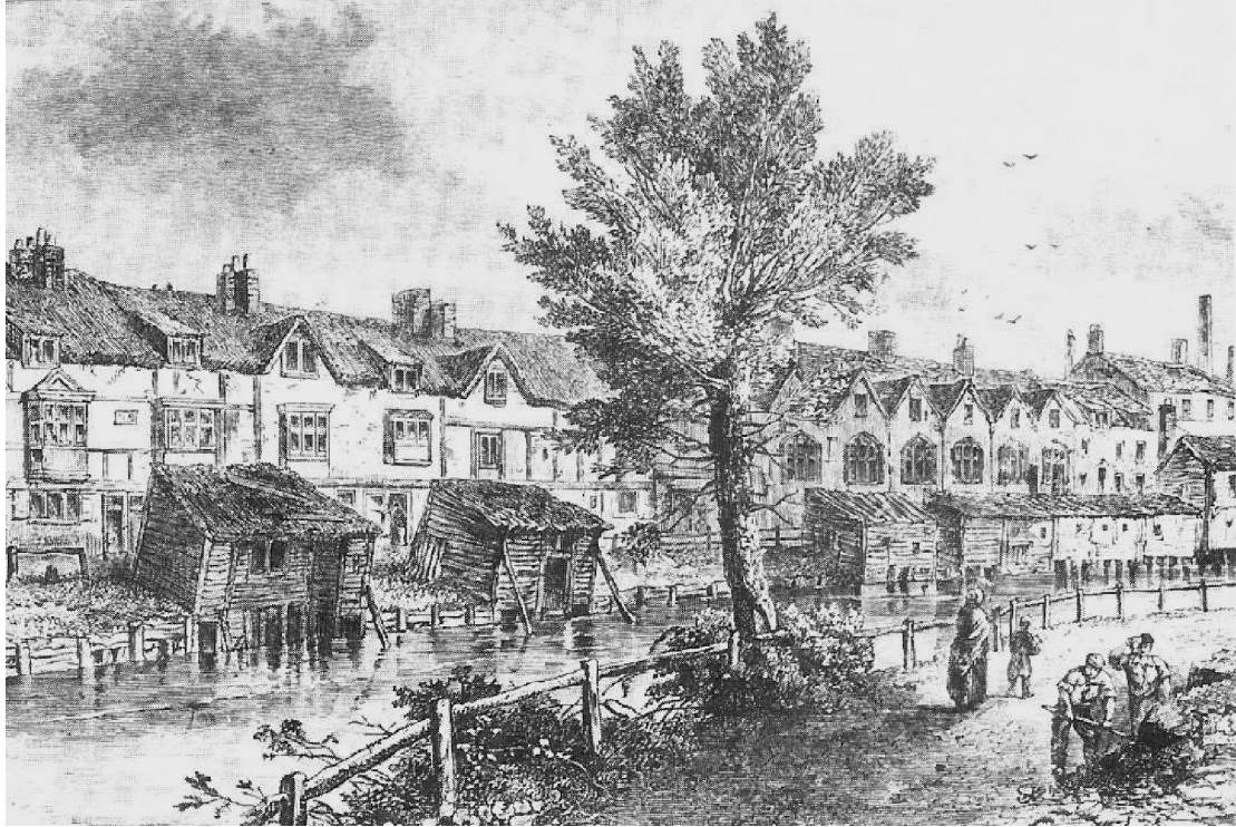
An illustration of housing in Bermondsey, London, in the mid-nineteenth century.

22 Look at the illustration, and then answer the questions which follow.