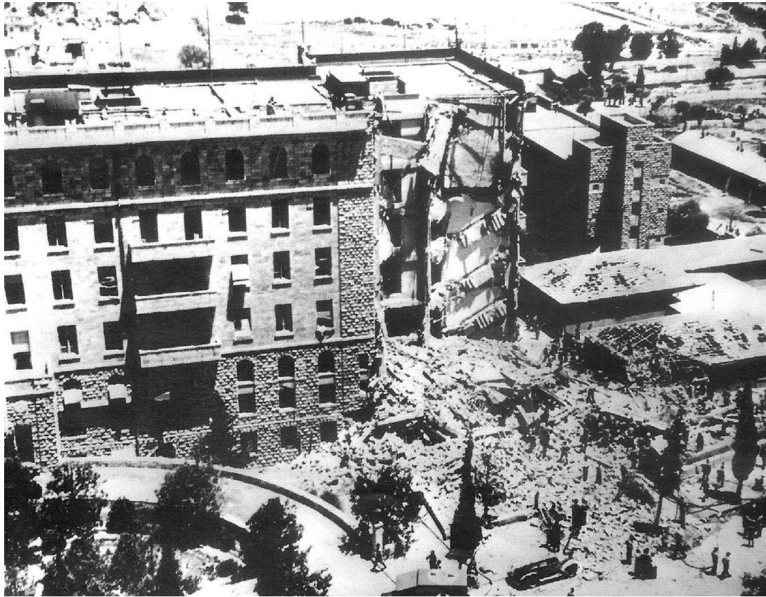
A photograph of the King David Hotel following the attack by Irgun members, July 1946.

20 Look at the photograph, and then answer the questions which follow.