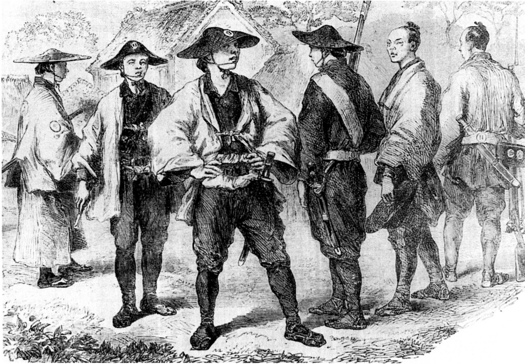
An illustration of Japanese soldiers in the 1860s in Western and traditional clothes.

4 Look at the illustration, and then answer the questions which follow.