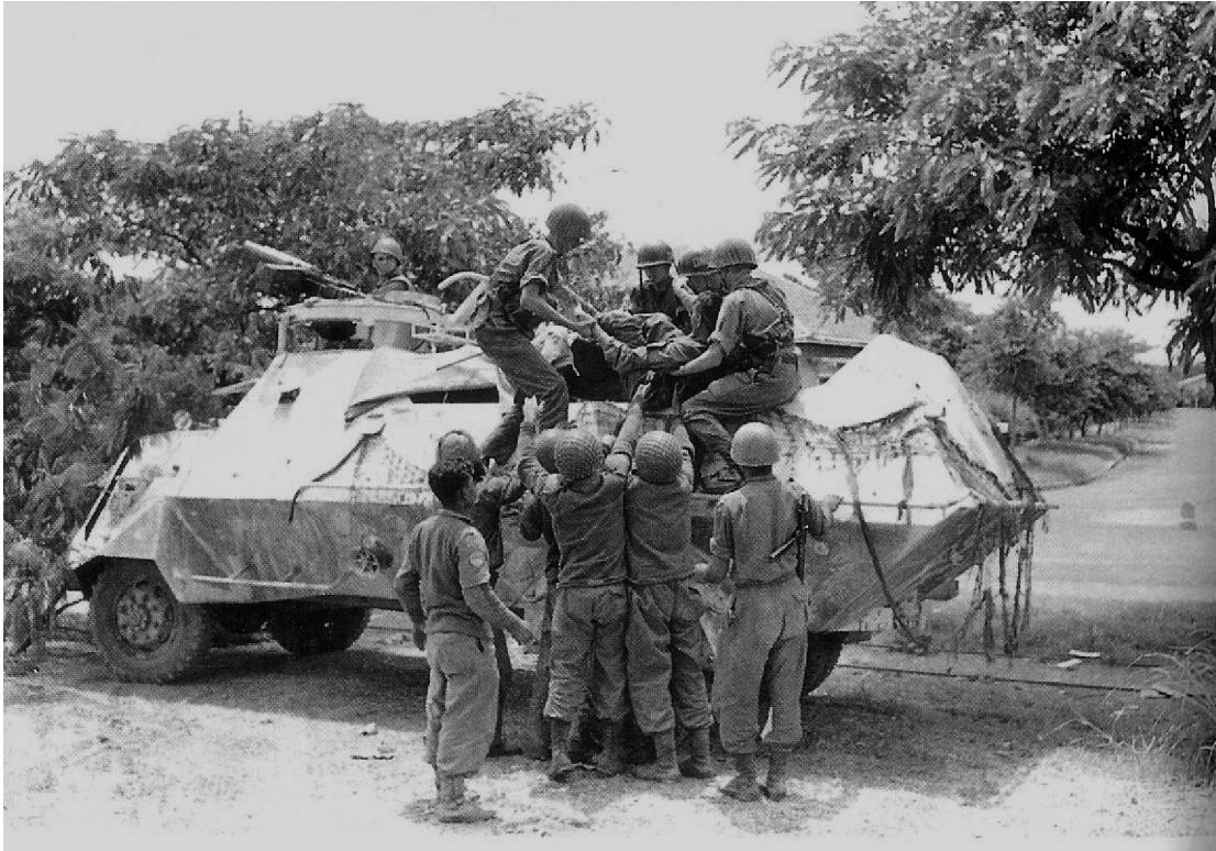
A photograph of a wounded soldier being lifted from a UN vehicle in the Congo in 1960.