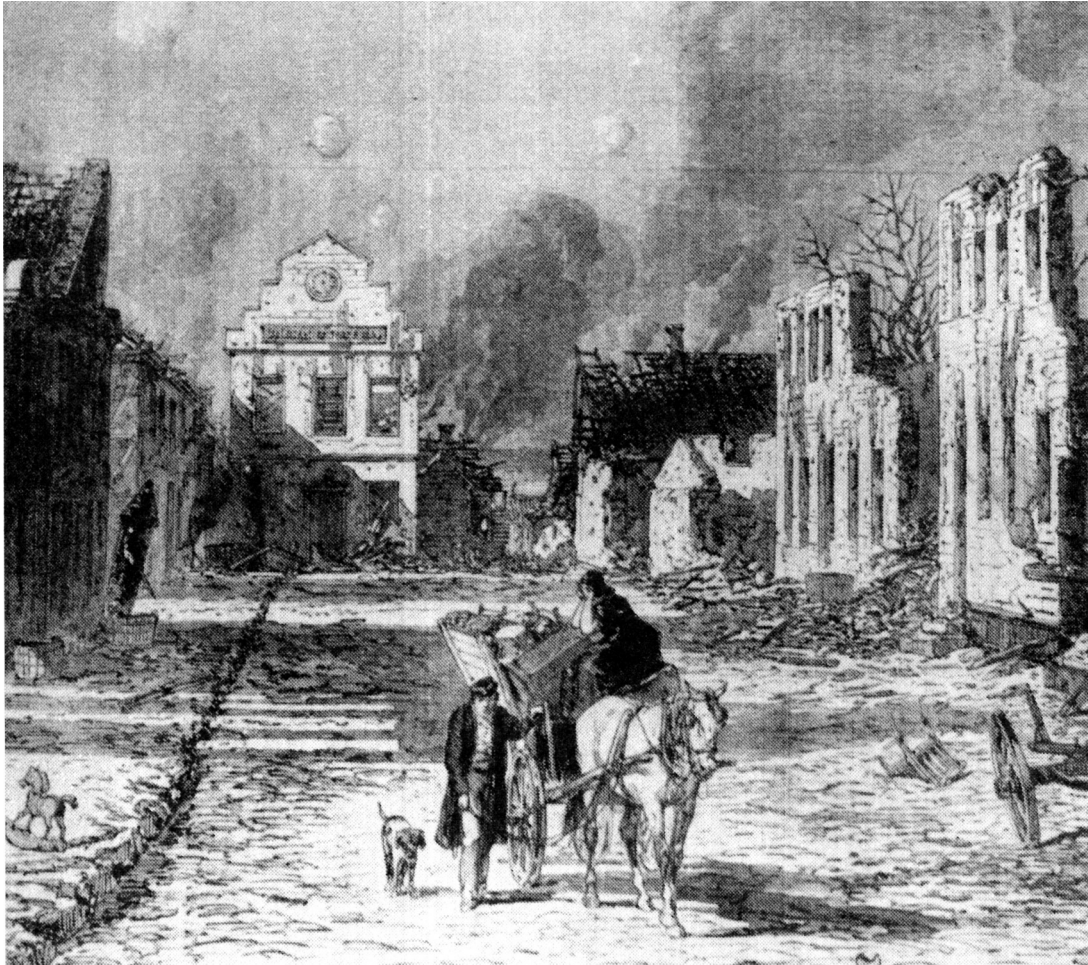
An illustration showing a Danish town in ruins after a bombardment by Prussian forces during the war of 1864.

2 Look at the illustration, and then answer the questions which follow.