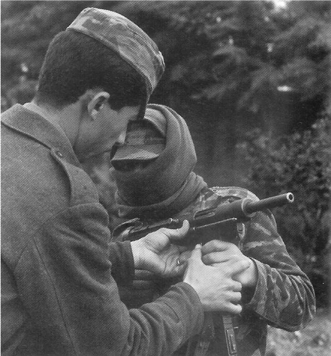
A young Fatah member receiving military training in 1966.

21 Look at the photograph, and then answer the questions which follow.