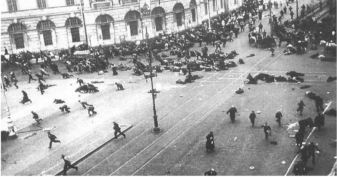
A photograph of troops firing on Bolshevik demonstrators in the streets of Petrograd, July 1917.

11 Look at the photograph, and then answer the questions which follow.