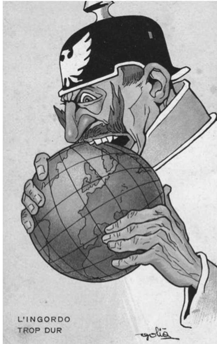
A French postcard published at the beginning of the war. The caption reads 'The glutton – too hard'. A glutton is someone who eats too much.