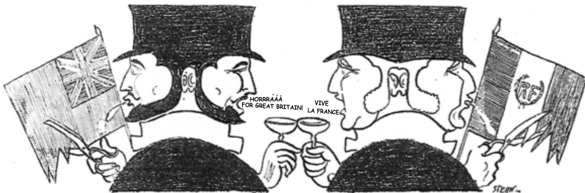
A cartoon published in Germany in 1903. The title of the cartoon is 'See the French-English alliance'.