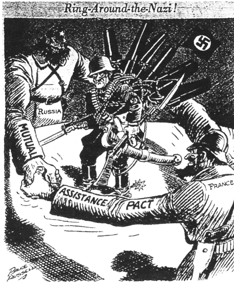
An American cartoon published in March 1936.