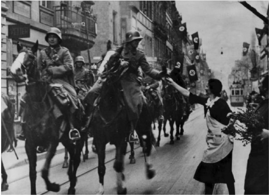
A photograph of German troops riding into the Rhineland on 7 March 1936.